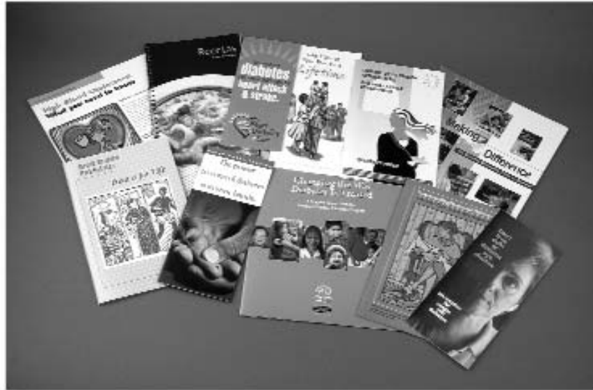
Public education materials for diabetes are developed by several institutes at the NIH. These publications help patients and their families manage daily life with diabetes and take steps to prevent diabetes and its cardiovascular, kidney, eye, and other complications. Some publications are available in Spanish and other languages and in easy-to-read versions.

The NDEP is the primary mechanism for translating the impressive results of the NIH's recently completed major clinical trial, the Diabetes Prevention Program (DPP), to the public and to health care practitioners. This multi-center trial