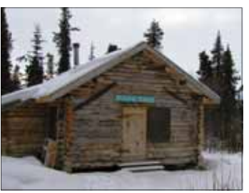
Viking Lodge Cabin