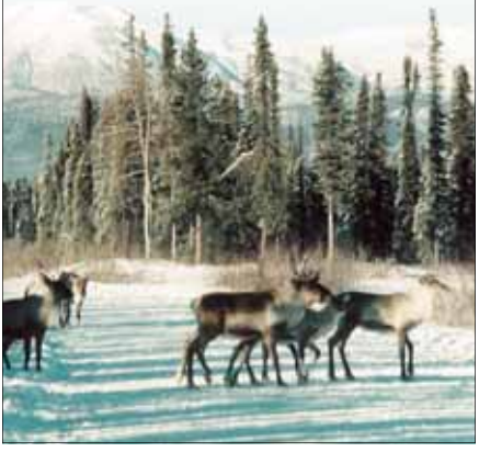
Short on services, but big on wilderness!