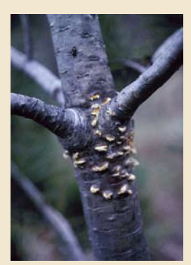
White pine blister rust

Firewood may contain nonnative insects and plant diseases. Bringing firewood into the park from other areas may accidentally spread pest insects and diseases that threaten park resources and the health of our forests. Management of trees infected with these pests involves drastic measures—even the complete removal of all trees (infested and otherwise) in the surrounding areas.