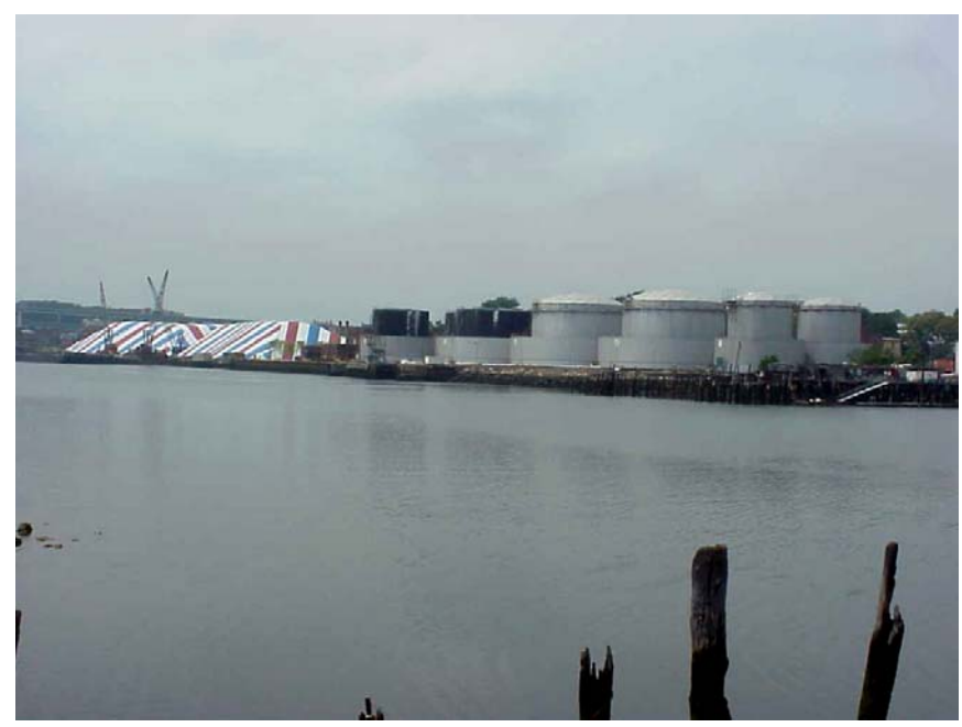
Some of the fuel storage tanks that line the Creek