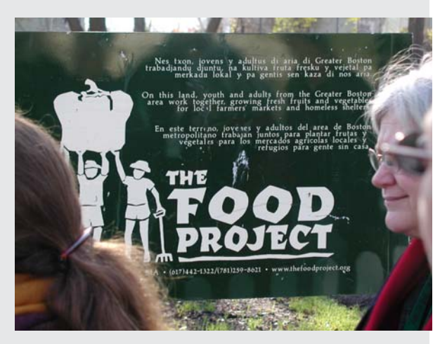
The Food Project is sponsoring a two-day urban agriculture conference in April.