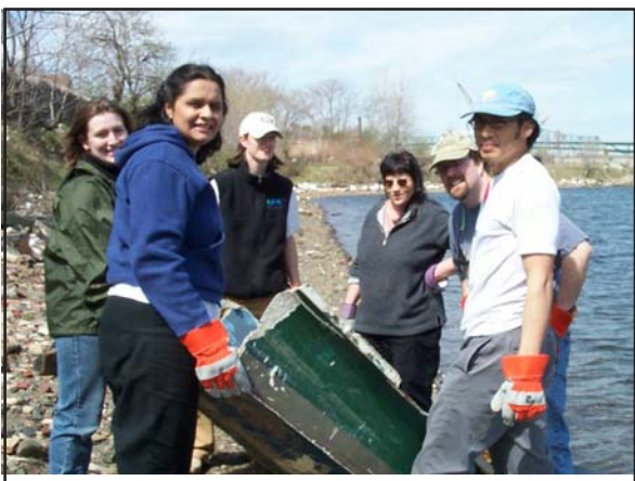
Volunteers clean up the banks of Chelsea Creek on Earth Day 2003.

So why not get out and help out this Earth Day? Read on below for more information about Earth Day events in your state. Note that the EPA is not the sponsor of the events