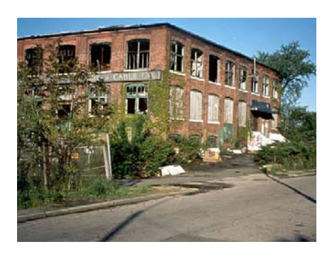
Bay Street Project Before Dorchester Bay Economic Development Corporation's $15 Million Brownfields Redevelopment Project.