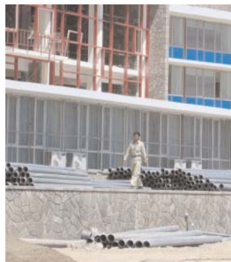
Workman finishing up the large new dormitory for women at Kabul University built by USAID. The univer-

2004 after girls were allowed to return to classes and refugees returned from abroad.