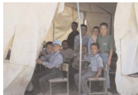
Boys attend class in a tent at Nau Behar School in Mazar-i Sharif. Enrollment leaped from 400 students in 2001 to 2,500 students in

2004 after girls were allowed to return to classes and refugees returned from abroad.