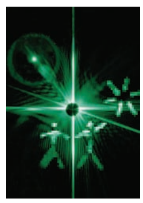
The diffraction pattern of a short, intense xray pulse directed at a protein formed the basis for this image, which was featured on the cover of Nature Physics . Flash diffraction imaging is a new method for gaining atomicscale information about complex biological molecules.

The experiment was performed at the free-electron laser at Deutsches Elektronen-Synchrotron (DESY) in Hamburg, Germany. The pulse illuminated a nanostructured object, and the team recorded the pattern of diffracted x rays. A Livermore-developed computer algorithm then recreated an image of the object based on the recorded diffraction pattern. The flash images resolved features 50 nanometers in size, about 10 times smaller than what is achievable with an optical microscope.