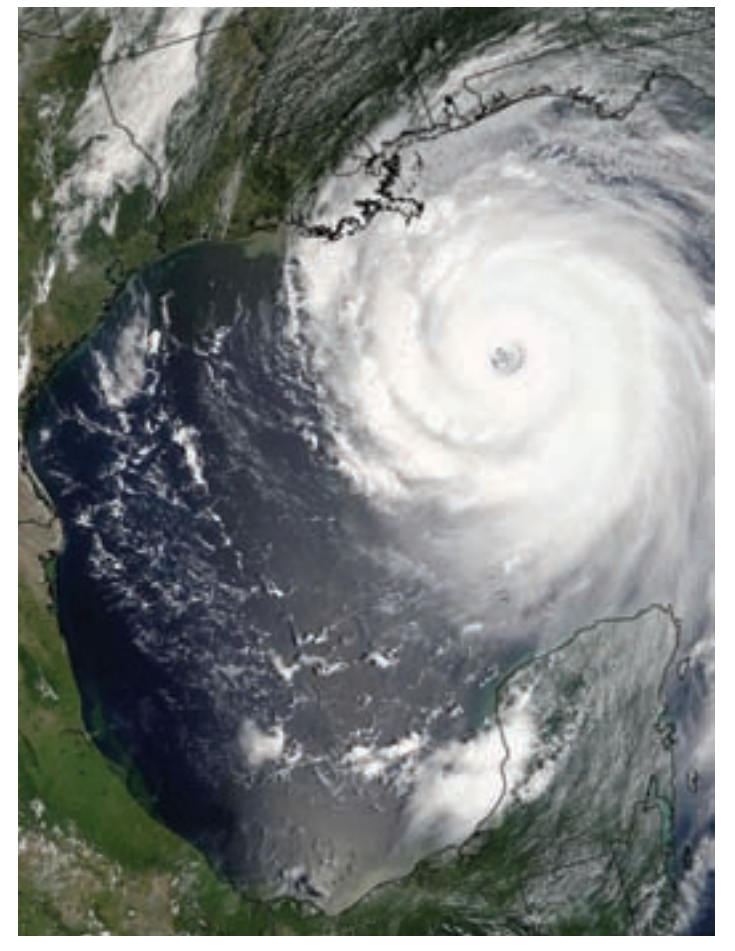
Research shows that the warming of the tropical oceans over the last century is linked to human activities, adding to evidence of a link between warming sea surface temperatures and increases in hurricane intensity, as exemplified by Hurricane Katrina.

California is another region of special interest. Research indicates that global warming may dramatically change river flows in the state. California's water infrastructure is efficient at providing