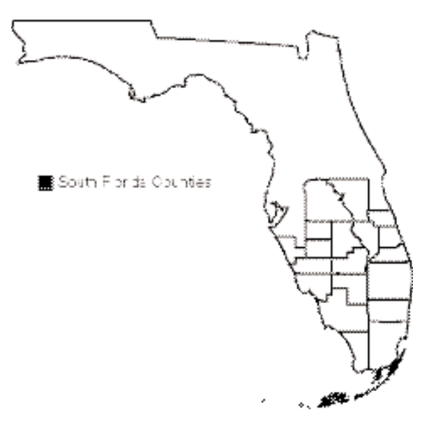
Figure 1. Florida distribution of the Key treecactus; within the U. S. this species is found only in the Florida Keys.

Pilosocereus robinii is a large, tree-like cactus known in the U.S. only from the Florida Keys. The Key tree-cactus produces large white flowers and a purplish-red fruit. It is a member of the rare and declining tropical hammock communities on Upper and Lower Matecumbe, and Long and Big Pine keys. Populations formerly found on Key West and Windley and Boca Chica keys are believed to be extirpated. As early as 1917, this cactus was on the edge of being extinct as a result of habitat destruction. The Key tree-cactus was listed as endangered because of severe population declines caused by destruction of its habitat for commercial and residential development.