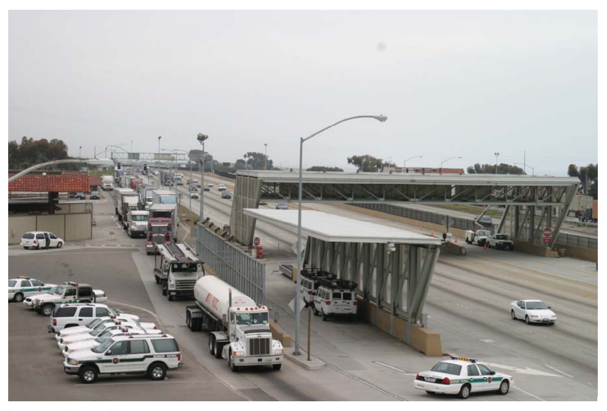
Picture 3. – Permanent checkpoint south of San Clemente, California on I-5