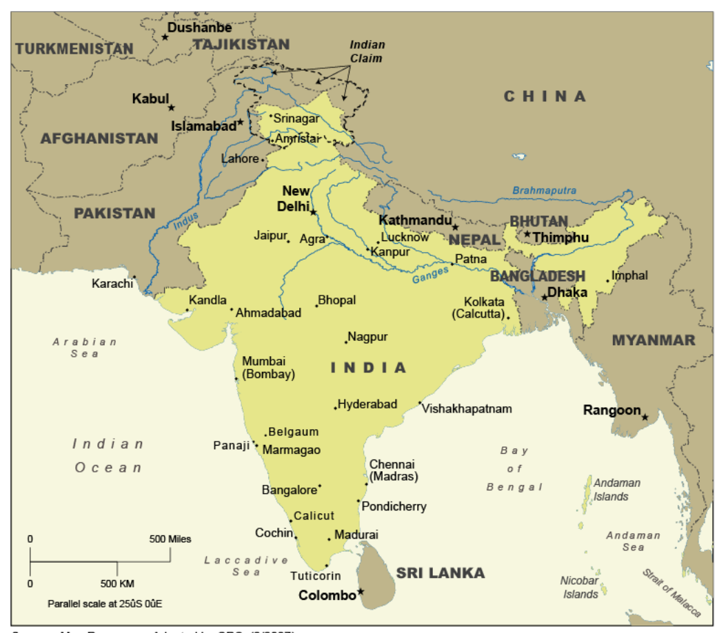
Figure 2. Map of India

Source: Map Resources. Adapted by CRS. (2/2007)