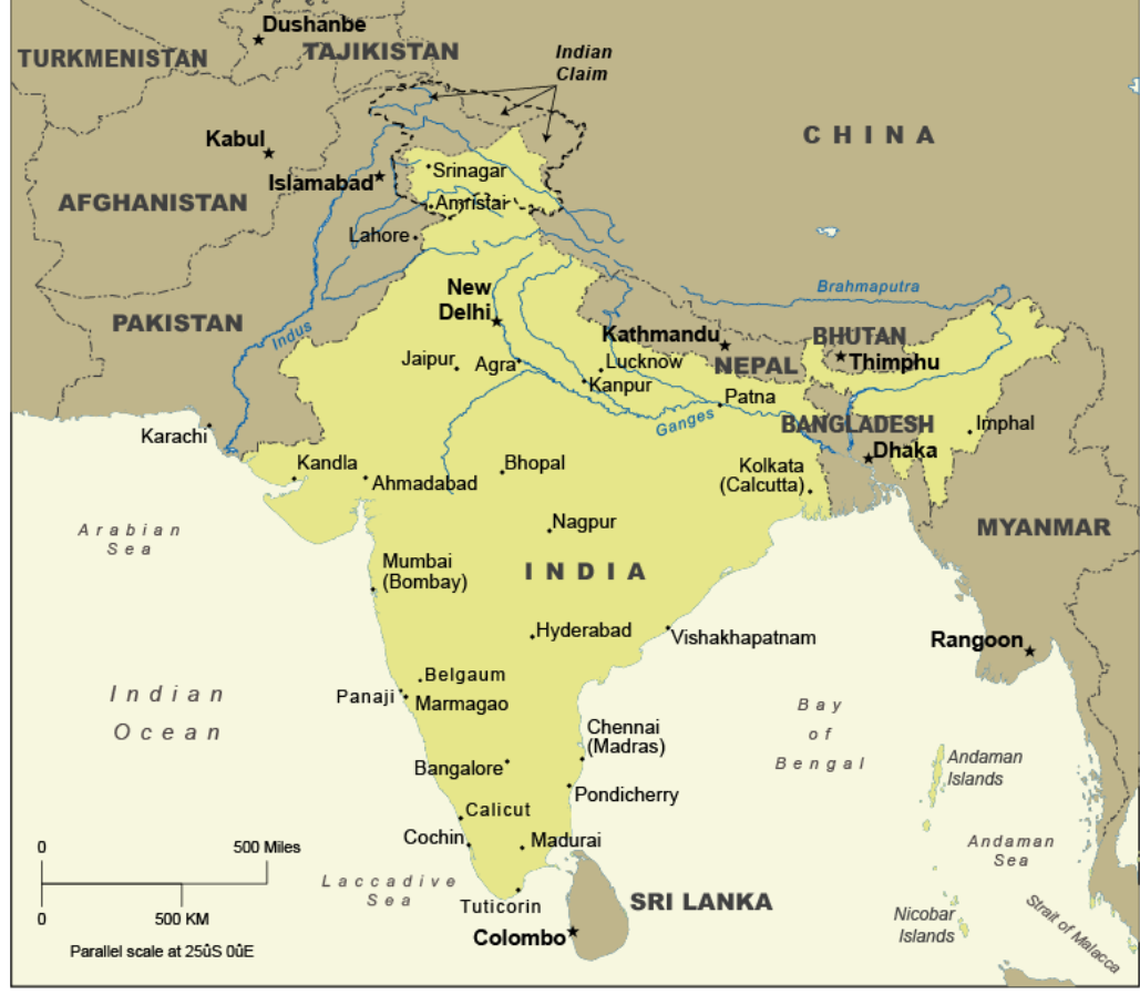
Figure 2. Map of India