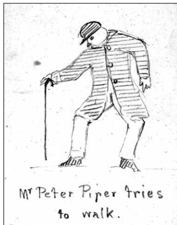
Illustration by H.W. Longfellow, 1860s

Longfellow’s other tales for children, “Peter Piper” and “Peter Quince,” are picture stories about someone who appreciates the comfort of home yet also has a passion for travel, as Longfellow did. Both Mr. Piper and Mr. Quince, however, had a talent for getting themselves into situations the cautious Mr. Longfellow would usually avoid, such as falling out of his balloon. The drawings are quite sophisticated, and the narrative is subtle. Like Longfellow, Peter Piper was cosmopolitan and enjoyed a haircut or a warm bath in France—an opportunity for