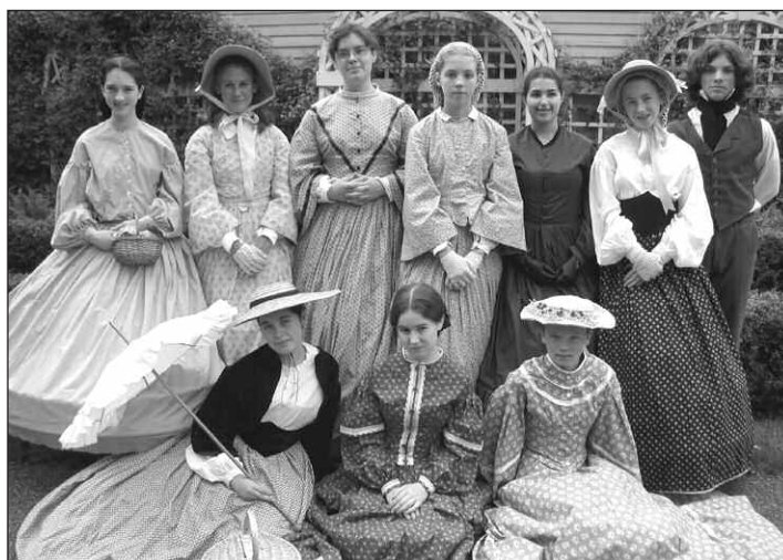
Concordant Junior Volunteers who helped out on Family Day, September 2005

Each volunteer will assume the role of a particular individual whom they have studied, and s/he will be stationed in the House's first-floor historic rooms. Written by the volunteers themselves, the re-enactment places the characters in the rooms chronologically so