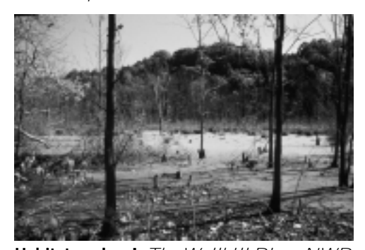
Habitats galore! The Wallkill River NWR is a mosaic of habitat types: wetland (pictured above), grassland, hardwood forest, riverine, and shrub. The CCP will encorporate regional and ecosystem perspectives in determining how much of each habitat type to manage for.