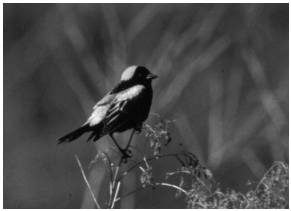
Bobolink. Old fields at the Wallkill River NWR are mowed in order to keep the vegetation from succeeding to forest. Grasslands and grassland birds, such as this bobolink, are in decline throughout the Wallkill River Watershed due to development and succession.