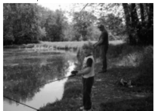
Fishing . Many people who fish on or near the Refuge mentioned water quality within the Wallkil River Watershed as a primary concern.