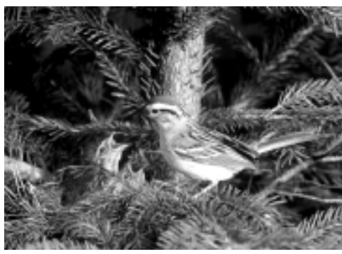
Chestnut-sided warbler.

The following pages summarize the 314 completed Workbooks we received, which include comments on wildlife habitat management, public use, land protection, and the Service's role in local communities. We would especially like to thank each of you who took the time to complete the Planning Workbooks. A more comprehensive summary of responses is available upon request from the Refuge office.