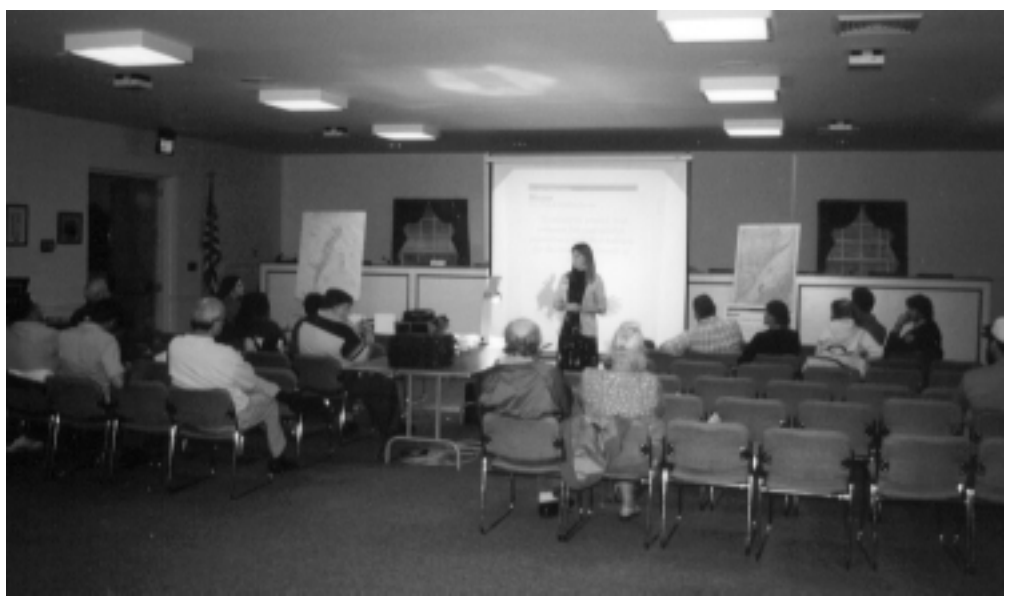
Public involvement. Open Houses were held in May and June in towns surrounding the Refuges.

Open Houses held in May and June helped us gain a better understanding of public opinion on issues affecting the Refuges. Comments on topics ranging from access to zoology were recorded during the meetings, and later condensed and sorted by topic.