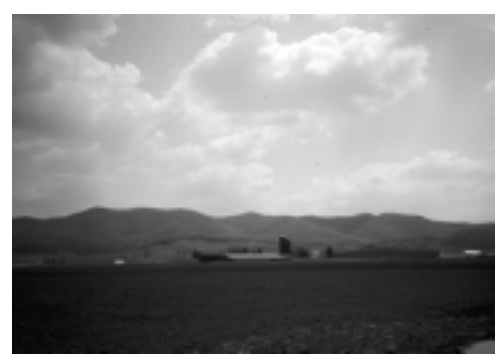
Majestic mountains. While striving to protect wildlife habitat, the Refuge also preserves some wonderful viewscapes. The Kittatinny Ridge provides the backdrop for the former Liberty Sod Farm, where the Appalachian Trail crosses the Refuge.