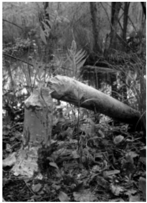
Timber! Throughout the Wallkill River NWR, one can see the handiwork of busy beavers.