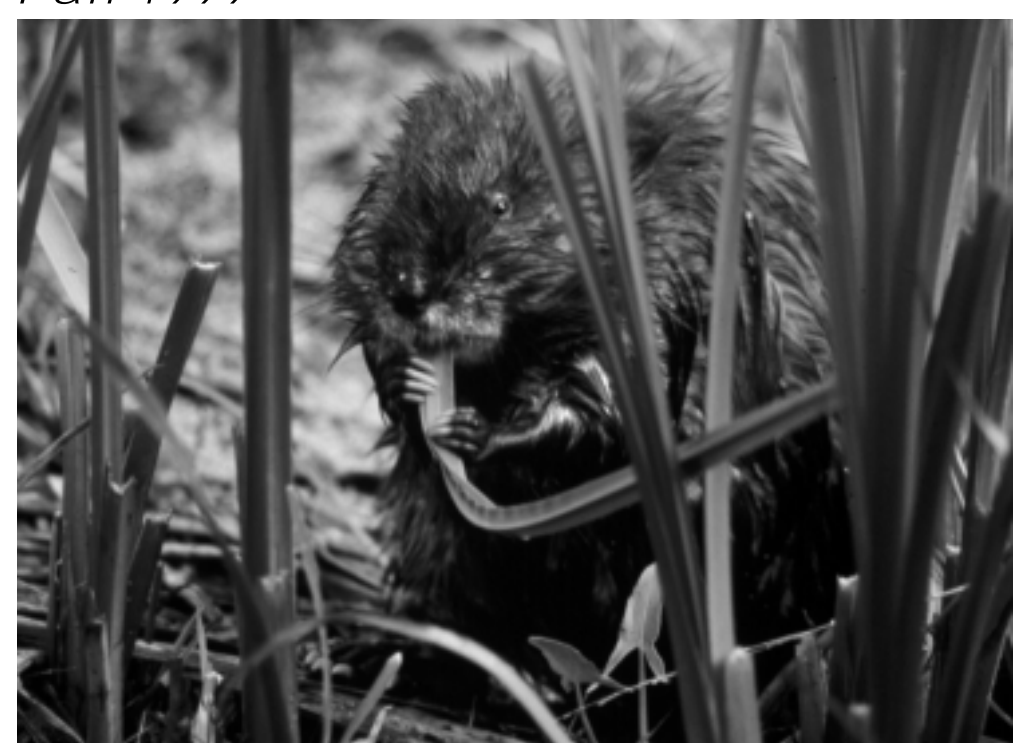
A portly muskrat enjoys some lunch while awaiting the release of the Wallkill River NWR and Shawangunk Grasslands NWR Comprehensive Conservation Plans.