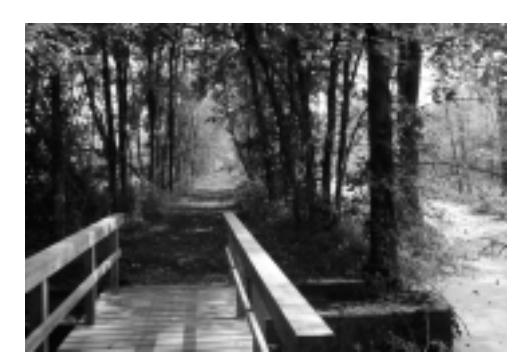
Wood Duck Trail. This trail allows visitors to observe wildlife at close range.