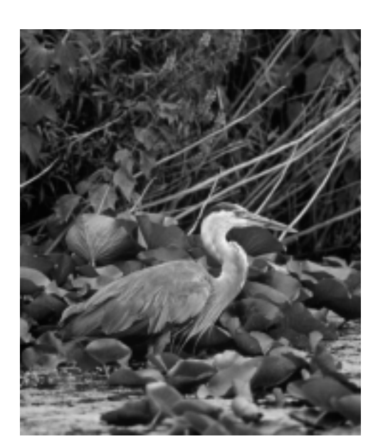
The fisher kings. Great blue herons and other wading birds will benefit from wetlands restoration.