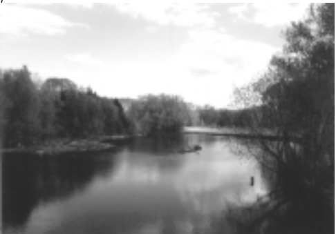
The Wallkill. Many people spoke passionately about the river during Open Houses and through Workbook responses. River issues included water quality, littering, canoe access, and fishing.

Additional details on why issues in the preceding question concerned the reader. (Responses were grouped and reworded, but not quantified. Open-ended question; 132 responses)