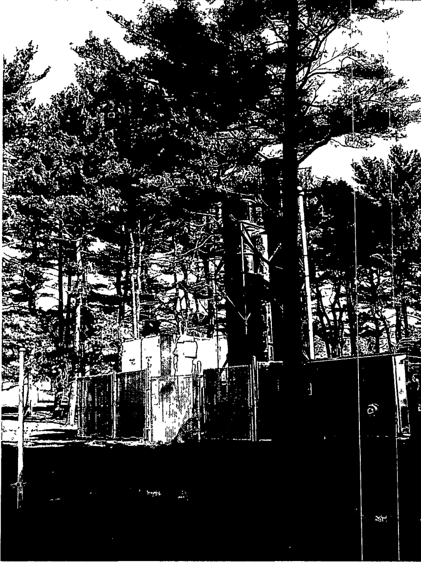
Photograph of the air-stripper treatment system present at Bally Municipal Well Number Three.