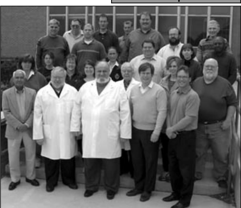
Members of CAMI's Bioaeronautical Sciences Research Laboratory

The American Board of Forensic Toxicology (ABFT) recently accredited the Bioaeronautical Sciences Research Laboratory at the Civil Aerospace Medical Institute. The lab also holds certification from the College of American Pathologists (CAP), which makes the Bioaeronautical Sciences Research Laboratory the only laboratory in the country to be certified by both the ABFT and the CAP.