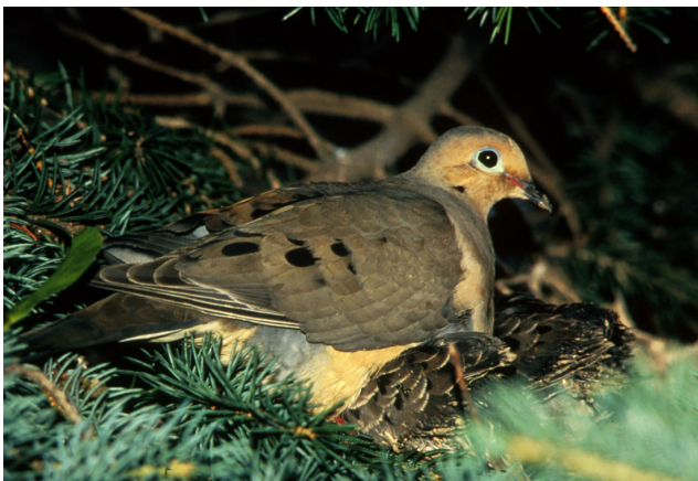
U.S. Fish and Wildlife Service

Mourning doves require fresh surface water for drinking on a regular basis. Puddles, ponds, and stream edges are suitable water sources. Doves will alight on unvegetated or lightly vegetated spots where visibility is good and where predators cannot easily hide, and where they can walk easily to the water's edge. Sandbars, gravel bars, and mud flats provide such drinking sites.