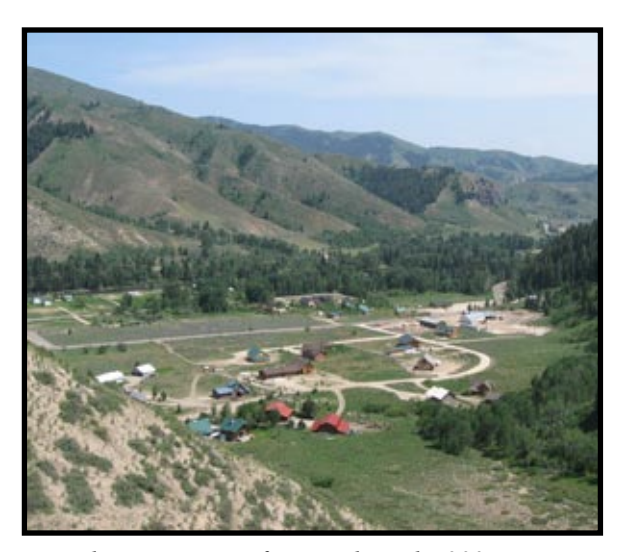
The community of Pine, where the 2007 FIRE Up students will complete their studies. The picture was taken from one of the plots that students will use to study fuels around the community.

gathering techniques. During the week of June 18-22, students will collect data on vegetation and structures in and around the community of Pine, Idaho, and will map the area using GIS/GPS data. The students will then use Red Zone to input data about structures in the subdivisions, to calculate hazard value, and to suggest specific mitigation measures each homeowner can take to decrease their homes' susceptibility to wildfire.