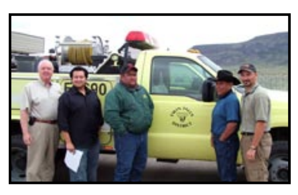
The Shoshone-Piute fire department gets the keys to the engine.

The Fire Danger signs include exchangeable fire danger adjectives such as extreme, very high, high, moderate, and low. These descriptions are changed throughout the fire season with BLM burning indices referred to as the indicator for the local area.