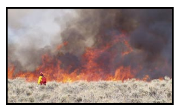
A Rawlins Field Office wildland firefighter conducts a prescribed burn at West Barrett to reduce potential fire risk and improve natural habitat.

was completed in 2006, greatly reducing the chance of escaped campfires.