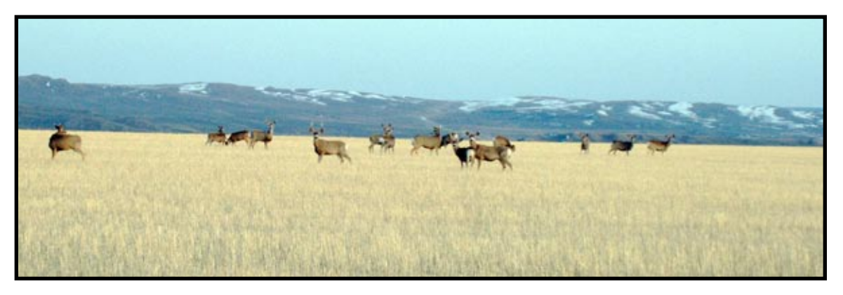
A herd of Mule deer grazing near Bennett Peak are an example of one of the resources at risk from out-of-control wildland fires. The deer and other native species benefit when habitat is improved from prescribed burns.