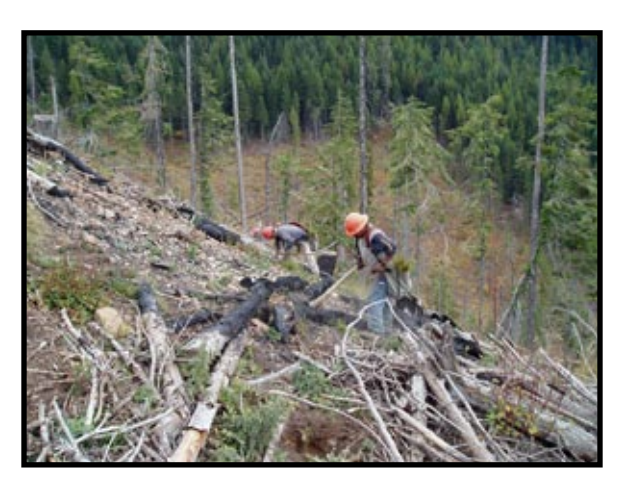
Contract workers planting rust-resistant western white pine and western larch.

Prior to reforestation, the field office broadcast burned the residual slash that had been mechanically piled above a road. Broadcast burning was used to reduce both activity and natural fuels and provide planting sites for the fall reforestation efforts. Most of the area below the road had been broadcast burned in the fall of 2005. Once burning was completed, the BLM contracted a