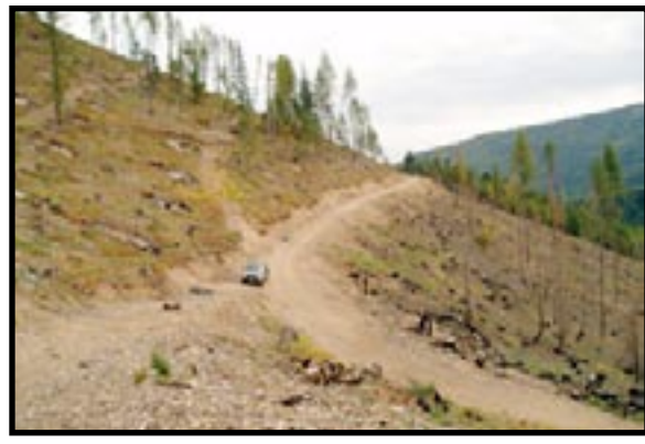
View comparing site preparation techniques (slashing/mechanical piling/pile burning) above road and partial slashing/Rx broadcast

crew to plant western larch and rust-resistant western white pine. The field office prefers to plant trees in the spring, but due to high elevation snow blocking access into the area, this delayed planting until the fall. This can be a relatively speculative operation since adequate soil moisture is critical to the survival of the tree seedlings. Should the fall rains be delayed much beyond the norm, seedling survival can be questionable. Since the Coeur d'Alene Field Office is using this particular project area as a site preparation test bed comparing broadcast burning to mechanical piling/pile burning, the permanent sample plots located in both treatment areas will be examined on a regular basis. The results will determine the need for brush release and/or pre-commercial thinning in order to benefit the desired western larch and western white pine. The skid trails and roads used during this project will heal when access is ultimately closed to this parcel.