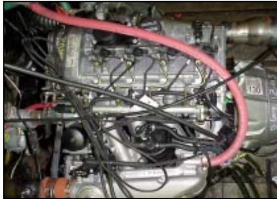
CIDI test engine.