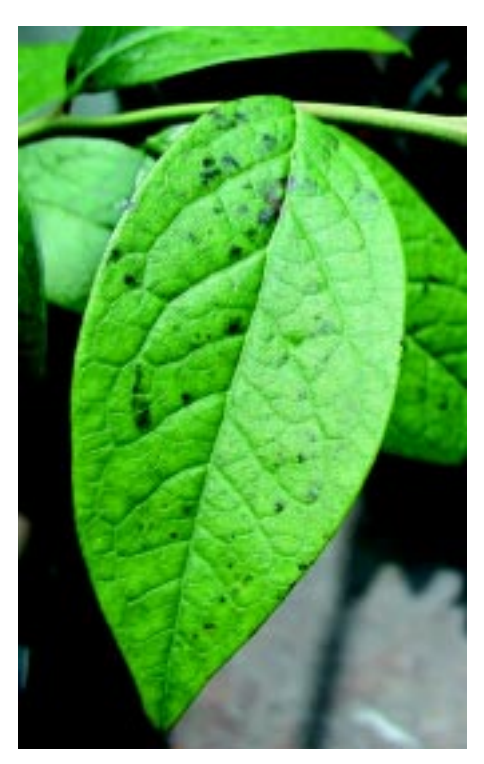
Small lesions on Vaccinium corymbosum 'Weymouth' infected by P. ramorum.

laboratory). Plants infected with P. ramorum should be destroyed because no chemical control measures are currently available. Because P. ramorum is a regulated organism, destruction and disposal protocols will be coordinated by state regulatory officials. If diagnosticians confirm P. ramorum infestation of plants at nurseries or other commercial landscape facilities, an Emergency Action Order from APHIS may be issued. The order may require that P. ramorum-infected plants and all susceptible plants within 2 meters of infected plants be destroyed and that all susceptible plants within 10 meters be held for 90 days until inspected.