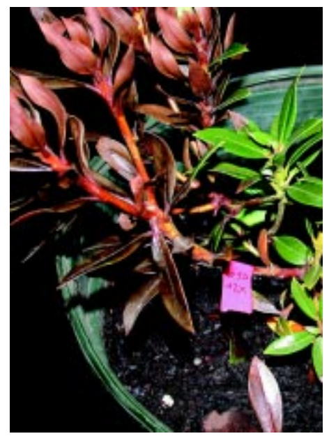
Kalmia latifolia 'Minuet' with severe foliar symptoms from P. ramorum.

laboratory). Plants infected with P. ramorum should be destroyed because no chemical control measures are currently available. Because P. ramorum is a regulated organism, destruction and disposal protocols will be coordinated by state regulatory officials. If diagnosticians confirm P. ramorum infestation of plants at nurseries or other commercial landscape facilities, an Emergency Action Order from APHIS may be issued. The order may require that P. ramorum-infected plants and all susceptible plants within 2 meters of infected plants be destroyed and that all susceptible plants within 10 meters be held for 90 days until inspected.