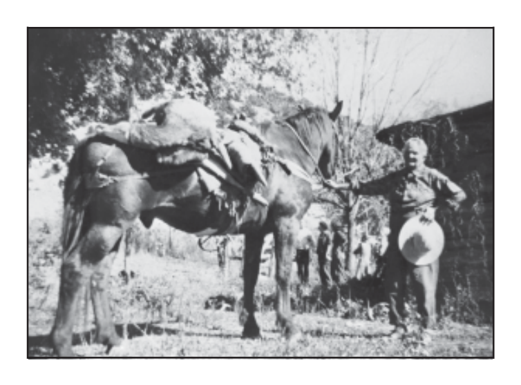
Researching and Interpreting Women's History for Historic Sites