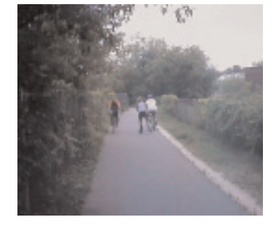
Living fence on the Waterfront Bikeway. Burlington, VT

The Canadian Pacific Railway (CPR) Police Service has had dramatic results in reducing crime and trespassing through RWT designs that have improved the aesthetic quality of an area. Their approach relies on the concept of "Crime Prevention Through Environmental Design" (CPTED), meaning, "the proper design and effective use of the built environment can lead to a reduction in the incidence and fear of crime — and to an increase in the quality of life" (Canadian Pacific Railway Police Service, 2000). Such designs attract families and large numbers of commuters and recreational users and discourage vandals and criminals, who thrive in abandoned, ugly areas. For the Oshawa Creek, Ontario, "Trespassing Prevention through Environ-