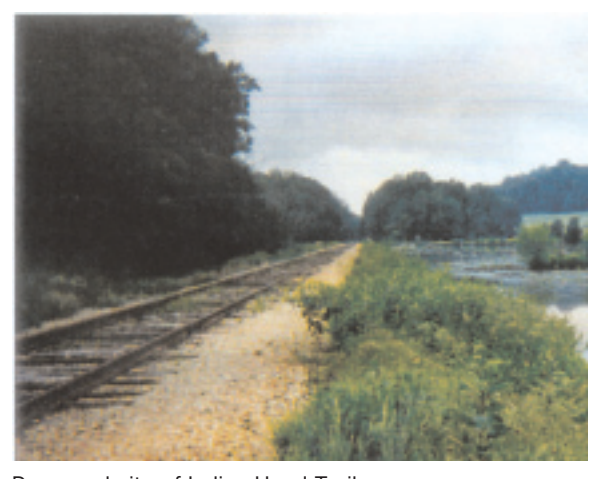
Proposed site of Indian Head Trail adjacent to Naval Surface Warfare Center Railroad. Charles County, MD

conclusion: Since there were viable on-road albeit less direct alternatives, this option was dropped from consideration.