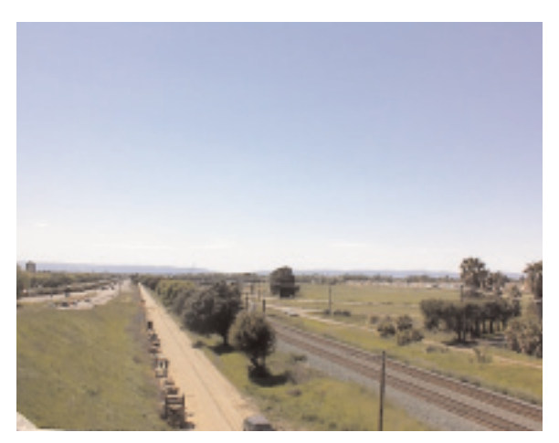
The Union Pacific Railroad planned track expansion led to a search for better alternatives. Davis, CA

SOLUTION: No easy solution. Trail developers would like to establish an at-grade crossing, while the UP representatives are opposed. An overcrossing would have an undesired impact on the community, while an underpass would not be environmentally feasible.