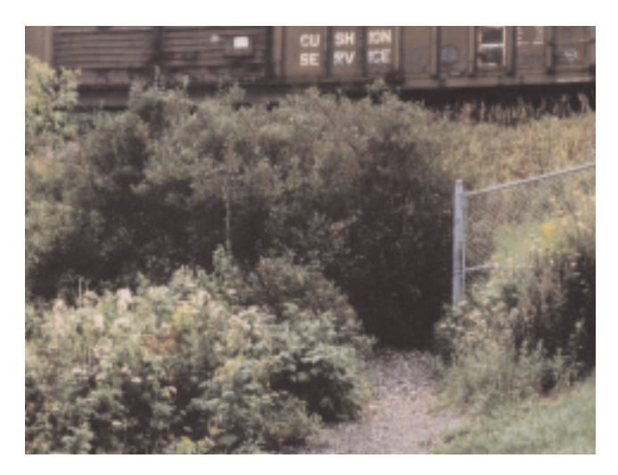
Beaten path made by children crossing tracks (left). New trail next to tracks leads to track undercrossing (right). Oshawa Creek, Ontario, Canada