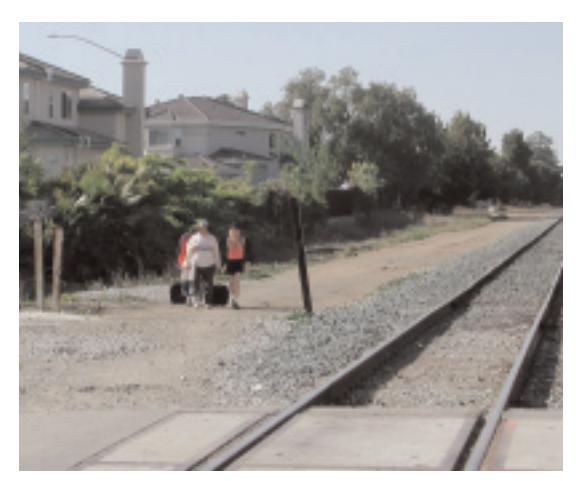
Adequate space along parts of proposed RWT. Cupertino, CA

off the east right-of-way line, leaving about 15 m (50 ft) of right-of-way to the west of track centerline. For approximately 3.2 km (2 mi), a Pacific Gas and Electric right-of-way parallels the UP right-of-way, allowing an additional 26 m (85 ft) to the west of the tracks. Constrained points include a tunnel, several drainages, and portions that are paralleled by a sound wall.