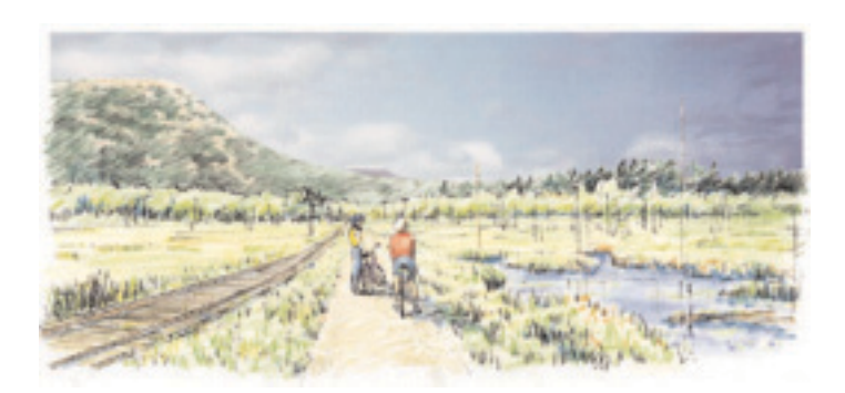
Environmentally sensitive area on proposed Downeast Trail along the abandoned Calais Branch owned by the State of Maine. Trail either will be on boardwalks or divert to an adjacent road. Calais, ME

Bikeway and trail networks are mapped out on both publicly and privately owned corridors as part of local general plans or master plans. Frequently, privately owned rail-road corridors appear as part of a local or regional bikeway or trail network before the railroad has been notified or with little to no railroad permission. However, RWT corridors should not be included on bikeway or trail plans unless the affected railroad is notified. If a proposed trail shown on a trail or bikeway plan is on private railroad property, this information must be noted on the plan. Trail planners should consider all reasonable alternatives to the RWT corridor.