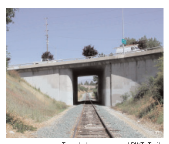
Tunnel along proposed RWT. Trail will be re-routed in this section. Cupertino, CA

PROBLEM: With addition of a barrier between the tracks and the trail, residents who currently trespass to use the corridor will not have good access to the trail.