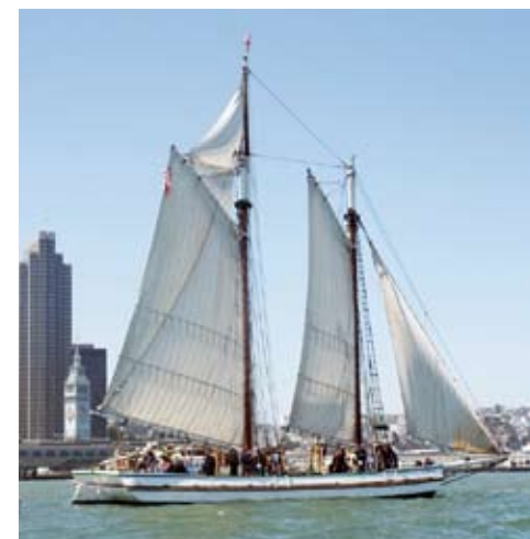
Alma sailing dates for fall 2008:

September 4, 6, 11, 13, 20, 27 October 4, 11, 18, 25 November 1, 8, 15, 22