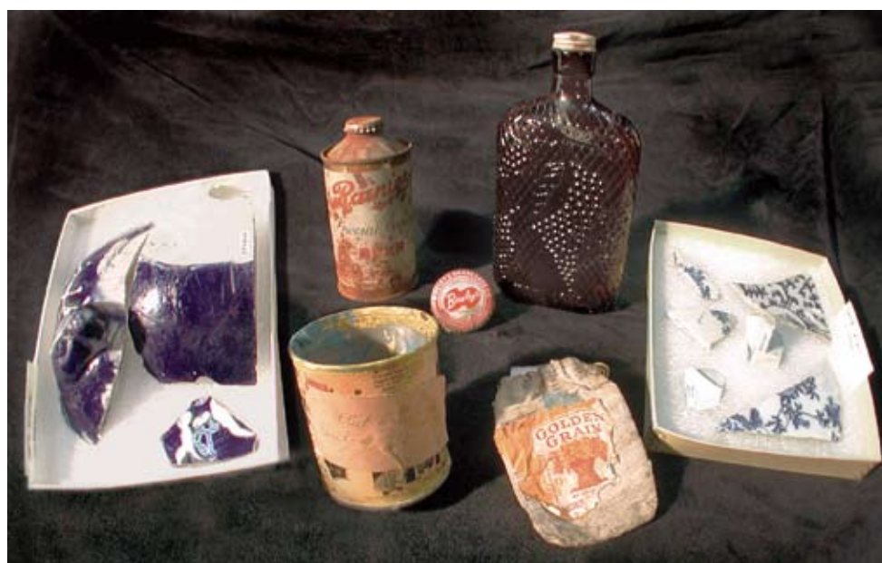
Photo from left clockwise, heavy stoneware sherds with dark blue, green and white glaze found in the pit dug for the elevator (SAFR 21672), Rainier beer cone-top can (21683), Orangeade bottle cap (21685), brown glass wine bottle (21684), sherds decorated with floral and geometric designs in blue glaze (21671), tobacco pouch (21686), and Calo Cat Food can (20298).