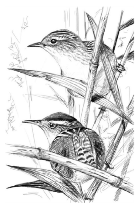
Sedge Wren & Marsh Wren