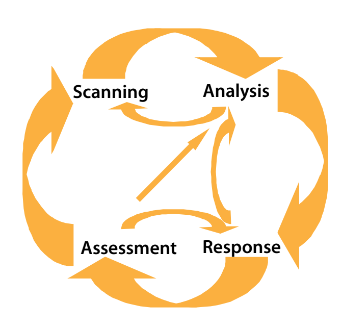
Figure 2: SARA Problem-Solving Process. (Clarke and Eck, 2003)