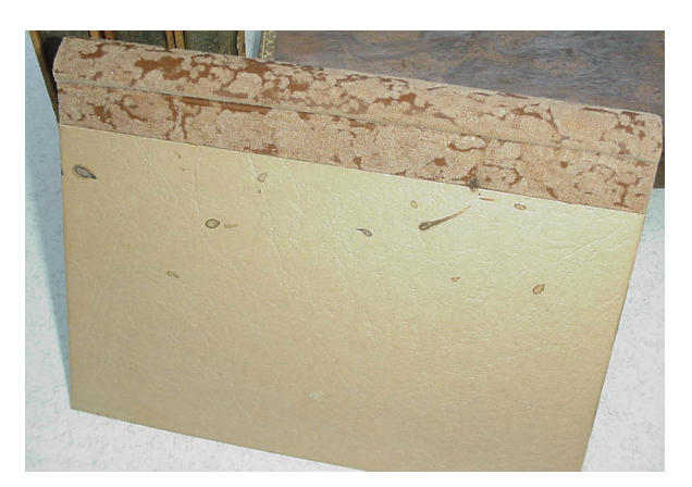
Figure 11. Cockroach damage to a book.

The oriental cockroach prefers decaying food, is cold tolerant and prefers damp areas with temperatures below 84°F. It is often found in bark mulch around the perimeter of buildings. The American cockroach requires a water source and prefers fermented foods. It can be found in sewers and basements, particularly around drains and pipes. Cockroach fecal pellets can resemble small mouse droppings without pointed ends.