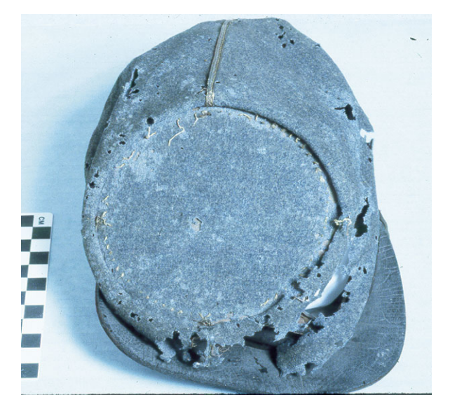
Figure 5. Civil War hat with damage from clothes moths and carpet beetles.

While many other moths are attracted to lights, these moths prefer dark closets, attics or other areas. The larvae tend to live and feed in dark corners in the folds of fabrics. Typically, the larva bites off a fiber, chews on it and moves on to the next fiber, resulting in a trail of damaged fibers. The clothes moth larvae may spin a feeding tube made of the fabric they are feeding on. Some spin small scattered silken patches and graze as they go along using the tube as protection. Look for feeding damage such as holes in woolen fabrics and hair falling from hides or pelts (Fig. 6). The color of the excreta usually takes on the color of the material on which it is feeding. Use these clues to locate infested collections.