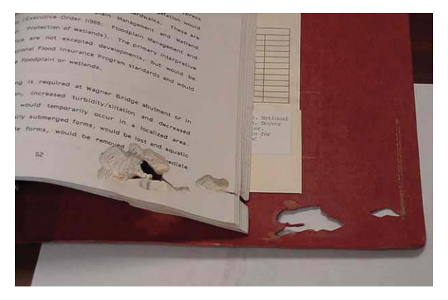
Figure 9. Drugstore beetle damage.

store beetle. Look for emergence holes and fine dust around target items to detect cigarette or drugstore beetle activity. Drugstore beetles can be detected by their feeding damage and sometimes leave shot holes (Fig. 9). The adults of both may be seen flying.