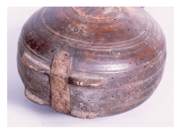
Figure 7. Canteen damaged by powderpost beetles.

Museum objects made of wood are susceptible to attack by a number of wood-infesting pests. In museums, the culprits are usually wood-boring/powderpost beetles and drywood termites. Both can severely damage valuable artifacts while remaining invisible to the untrained eye.