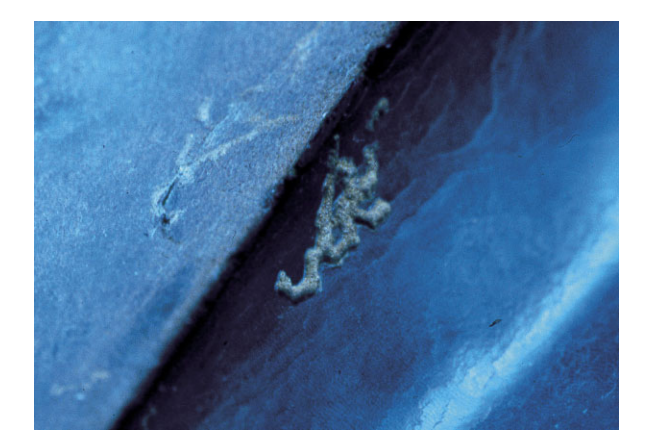
Figure 4. Leather cartridge box with tunneling by hide beetle.

The three hide beetles that cause the most damage are the larder beetle, hide or leather beetle, and black larder beetle. They feed on skins and feathers such as dead bird or mouse carcasses in attics, stuffed animals in museum collections and in birds' nests. Both the adult and larval stage damages materials. Look for feeding damage and frass created (Fig. 4) as they often burrow into or graze the surface of their food source.