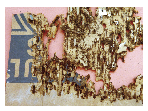
Figure 10. Silverfish damage.

Silverfish and firebrats prefer starchy foods and will eat fabrics, paper and sizing, and the glue and paste in older book bindings. They are omnivorous and will eat protein materials as well as cellulose (Fig. 10). Silverfish prefer moist situations with temperatures of 70° to 80°F and can be an indicator of moisture problems. Firebrats prefer temperatures in excess of 90°F. Signs of an infestation are seeing the insect or finding their feeding damage.