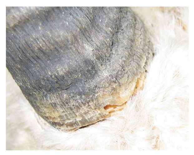
Figure 1. Dermestid larvae damage to horn.