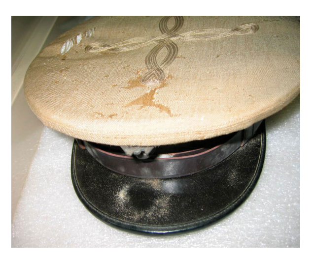
Figure 3. Grazing damage and frass from varied carpet beetle larvae.

The four most commonly encountered species of carpet beetles are the black carpet beetle, varied carpet beetle, furniture carpet beetle, and common carpet beetle. The larval stage of all carpet beetles is responsible for the damage. A carpet beetle infestation results in feeding damage (Fig. 3) and cast larval skins.