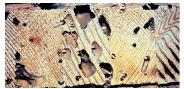
Figure 8. Drywood termite damage to a wooden door.

Unlike their cousins the subterranean termites that require a constant moisture source, drywood termites establish colonies in dry, sound wood with low levels of moisture and do not require contact with the soil. Drywood termites attack wooden items of all kinds. Most infestations are in building structures but furniture and wooden objects in museum collections may also be attacked. The excavated galleries or tunnels feel sandpaper-smooth. Dry and loose, their distinct six-sided fecal pellets are found in piles where they have been kicked out of the chambers. Other than the pellets, there is very little external evidence of drywood termite attack in wood as they tend to work just under the surface of the wood (Fig. 8). Swarming adults may also be a sign of an infestation. Winged termites have four wings of equal length whereas carpenter ants have four wings of two different lengths.