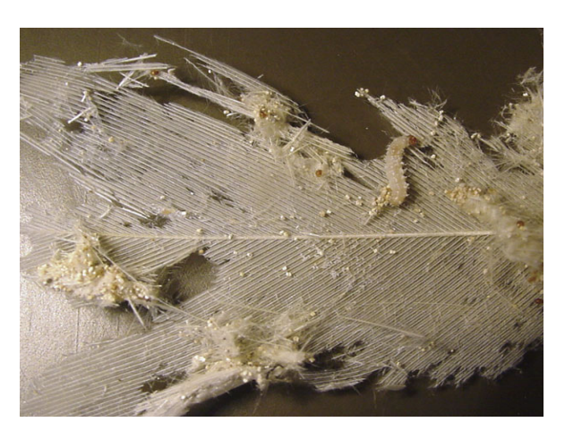
Figure 6. Webbing clothes moth damage. (Patrick Kelley, Insects Limited, Inc.)