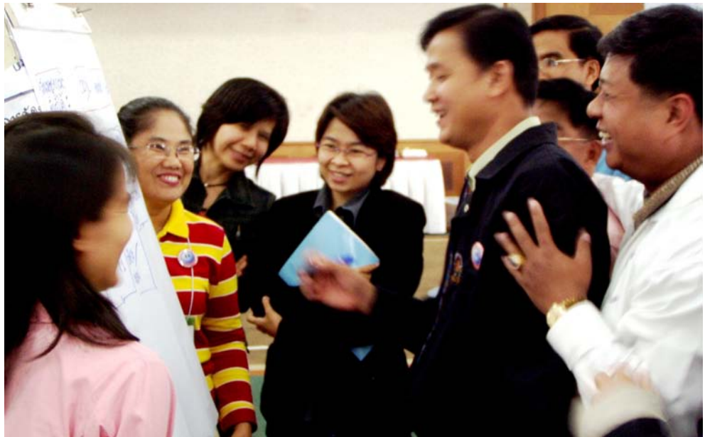
Medical and public health personnel of Lopburi and Phitsanuloke provinces work on a countermeasure activity during the second Thailand SMTTC workshop.

Hold a second TQM workshop in 2006 for public health practitioners from the rural provinces of Lopburi, Nakhonsawan, and Pittsanulok and from the central province of Nonthaburi, assisted by SMDP staff.