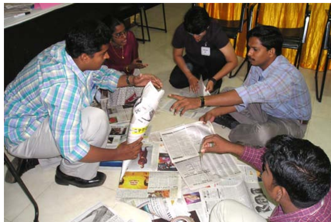
INP+ workshop participants carry out a team-building exercise during the Healthy Plan- it TM program management workshop, in Chennai, Tamil Nadu.

The MIPH 2004 graduate from GAP India plans to conduct a workshop on leadership and team building for INP+ managers in spring 2006. In addition, INP+ has requested Healthy Plan- it TM workshops for other DLNs, and Tambaram Hospital's CDC-sponsored Medical Graduate Fellowship program has requested management training.