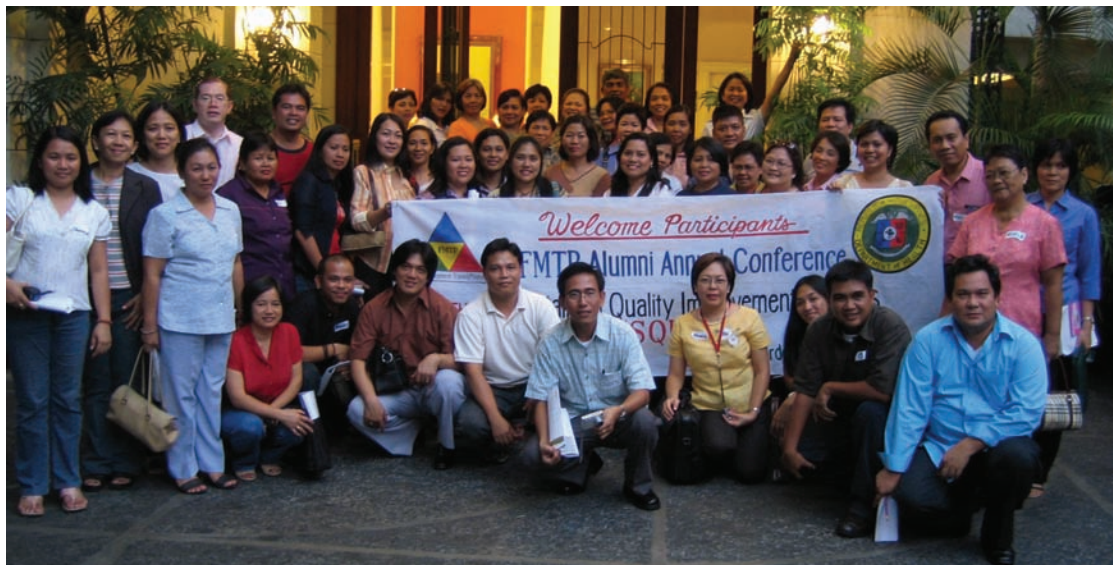
Participants at the first FMTP Alumni Annual Conference in Manila in May 2005.

In May 2005, the FMTP organized the first National Conference for MIPH and FMTP alumni. The conference, attended by 70 graduates, served as a useful opportunity to share best practices for management training, to develop advocacy strategies for starting new regional programs, and to network with other professionals.