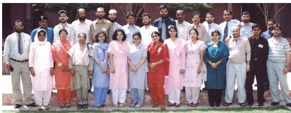
HSMR graduates from Afghanistan and Pakistan pictured in 2005 in the courtyard of the AKU Department of Community Health Sciences.

The CHS department at AKU recently initiated the Afghan Capacity-Building Program under the Aga Khan Development Network, a consortium of development agencies working in health, education, and economic