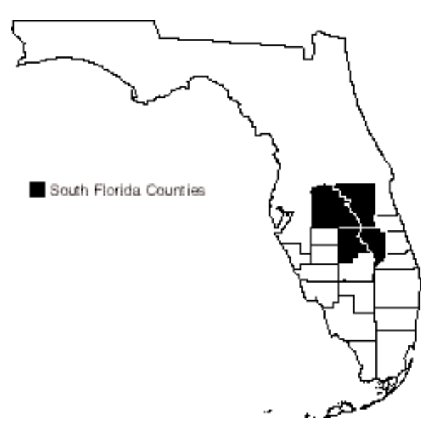
Figure 1. County distribution of the Florida

The Florida grasshopper sparrow is a subspecies of grasshopper sparrow that is endemic to the dry prairie of central and southern Florida. This subspecies is extremely habitat specific and relies on fire every two to three years to maintain its habitat. Because of declines in the sparrow's suitable habitat and population size, the National Audubon Society placed the Florida grasshopper sparrow on its blue list in 1974. This species was listed as endangered by the State of Florida in 1977. The FWS listed the Florida grasshopper sparrow as endangered in 1986 because of habitat loss and degradation resulting from conversion of native vegetation to improved pasture and agriculture.