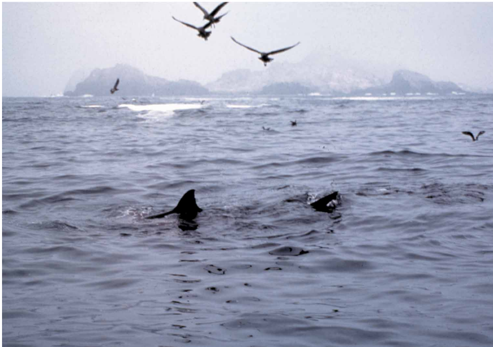
Figure 4. Gulls hover over a predatory attack by a white shark on a northern elephant seal. Southeast Farallon Island is in the background.