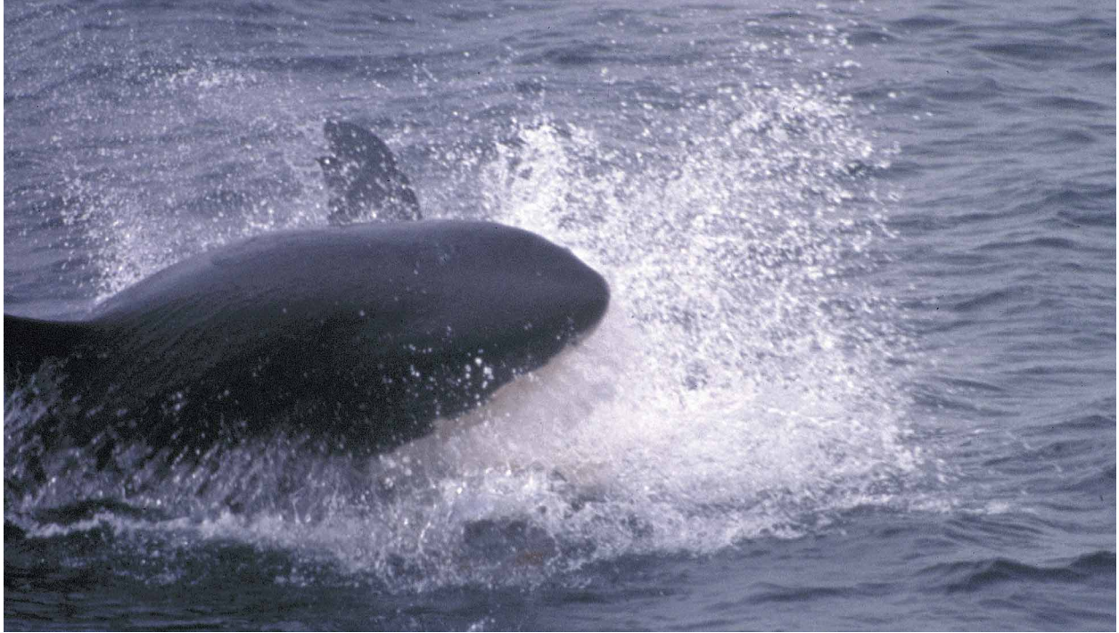
Figure 5. Attack by white sharks is violent and quick; the sharks can strike quickly because they are warm blooded.