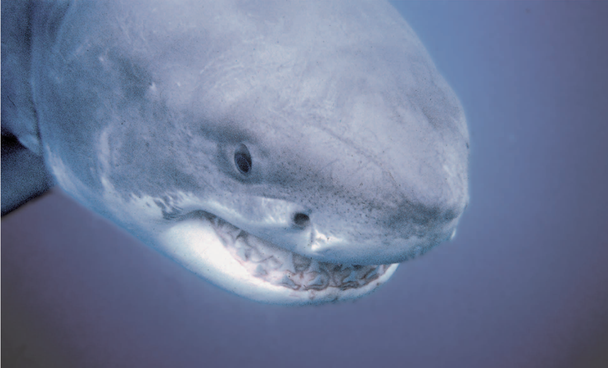
Figure 1. The white shark is a fearsome predator, well adapted to live in cold water, where food is more abundant. It is far from a “primitive” cold-blooded fish but is actually a highly evolved warm-blooded animal.