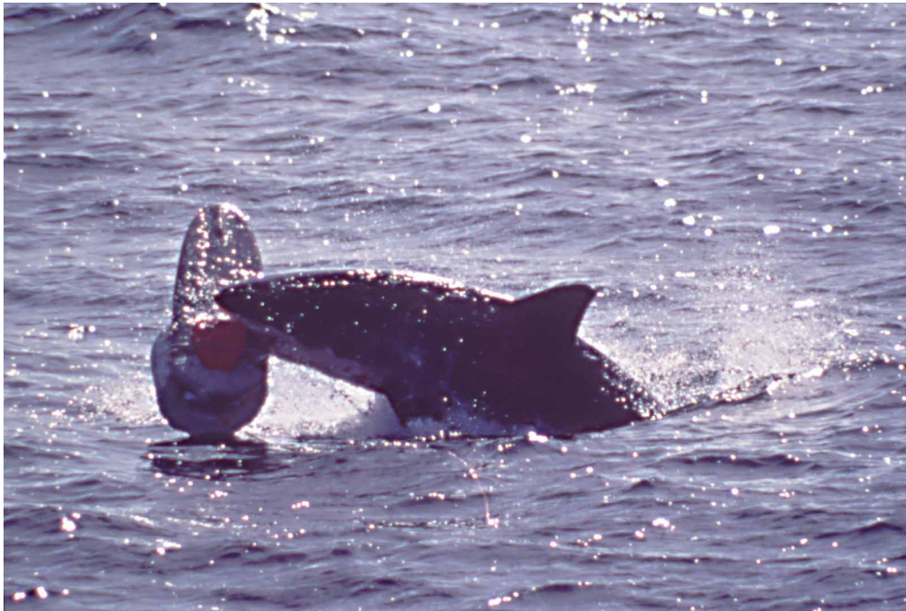
Figure 6. A decoy is struck during a study to determine how the white shark attacks its prey.