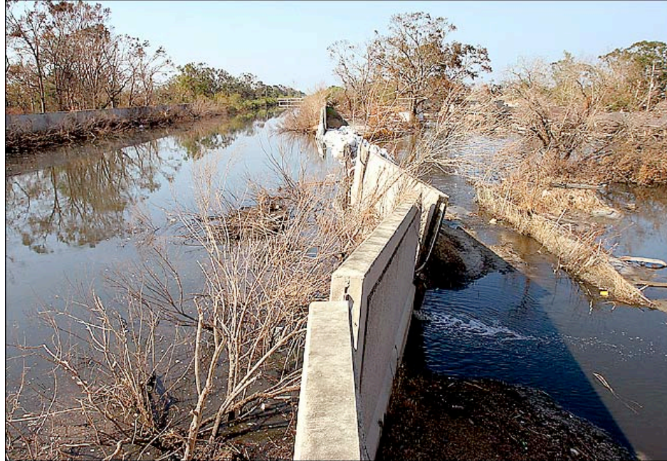
Levees in New Orleans, broken at their thermal expansion joints.