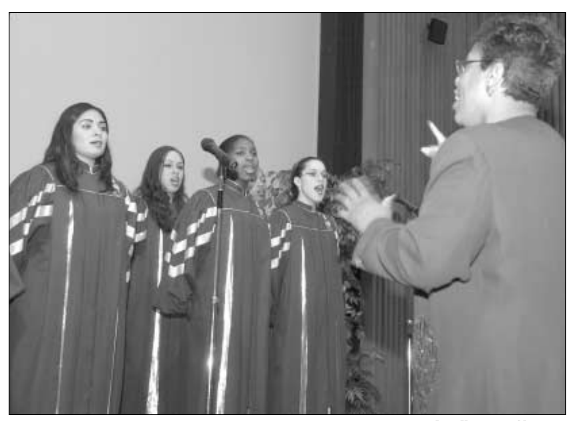
The Castleers, a choir of Oakland high school students, performed during the afternoon's MLK activities.