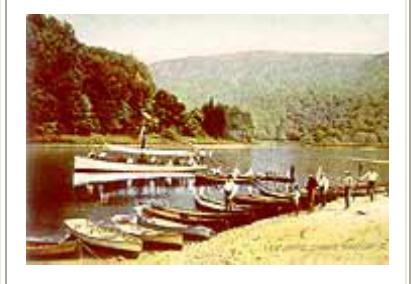
The landing in Delaware Water Gap PA, with steamship Kittatinny II (1899) passing by.

In front of Kittatinny Hotel (now Resort Point Overlook PA)