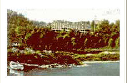
Kittatinny Hotel atop Mt. Minsi in Delaware Water Gap PA, seen from Kittatinny Point NJ.

Kittatinny Hotel in the town of Delaware Water Gap PA, seen across the Delaware River at the Water Gap from Kittatinny Point NJ.