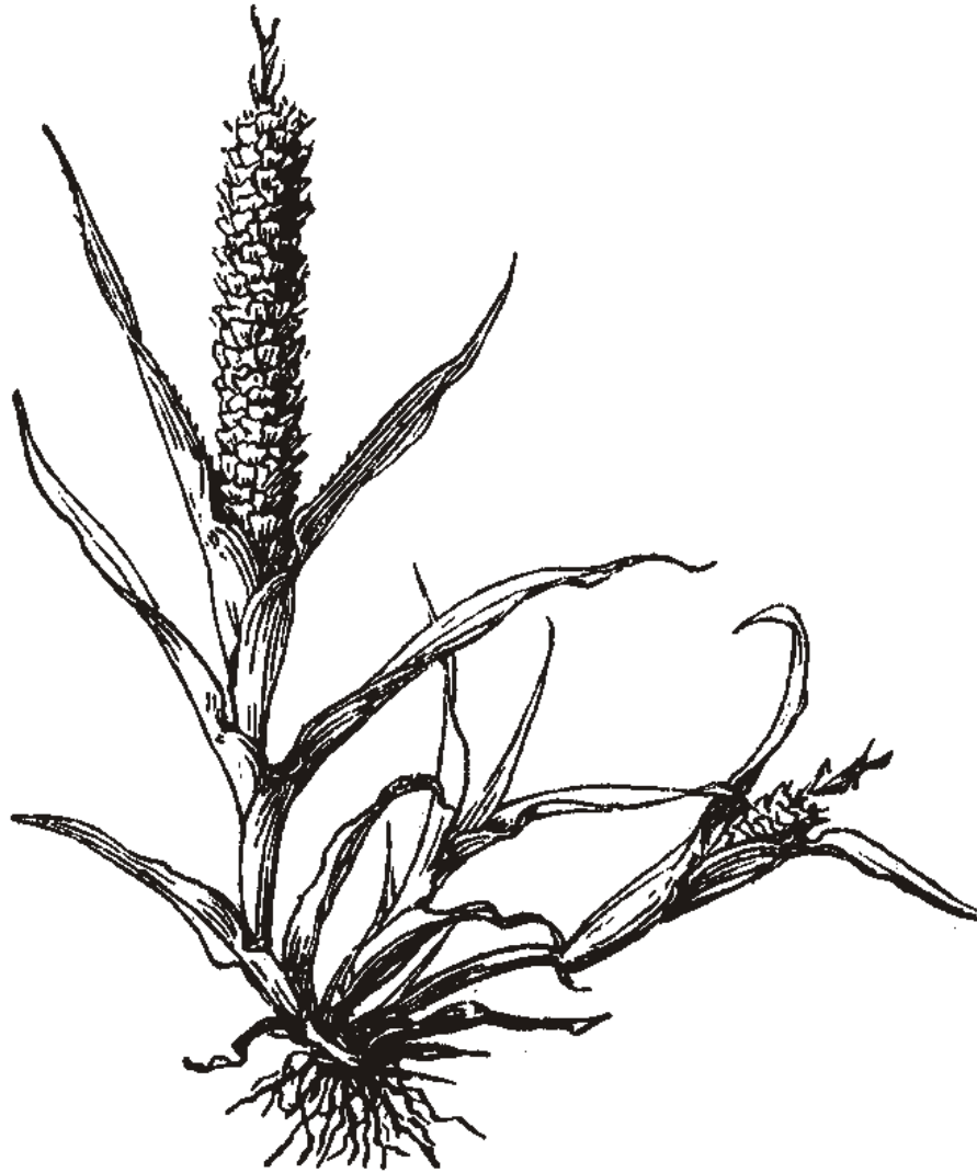
Figure II-11. Illustration of Neostapfia colusana (Colusa grass). Reprinted with permission from Abrams (1940), Illustrated Flora of the Pacific States: Washington, Oregon, and California , Vol. I. © Stanford University Press.