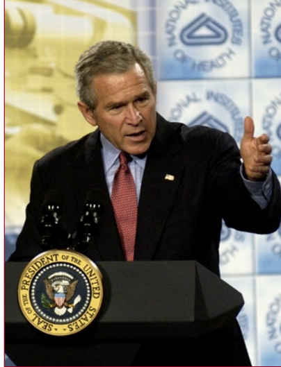
ABOVE • President Bush highlights week of VIP visits to NIH. See photos, p. 12