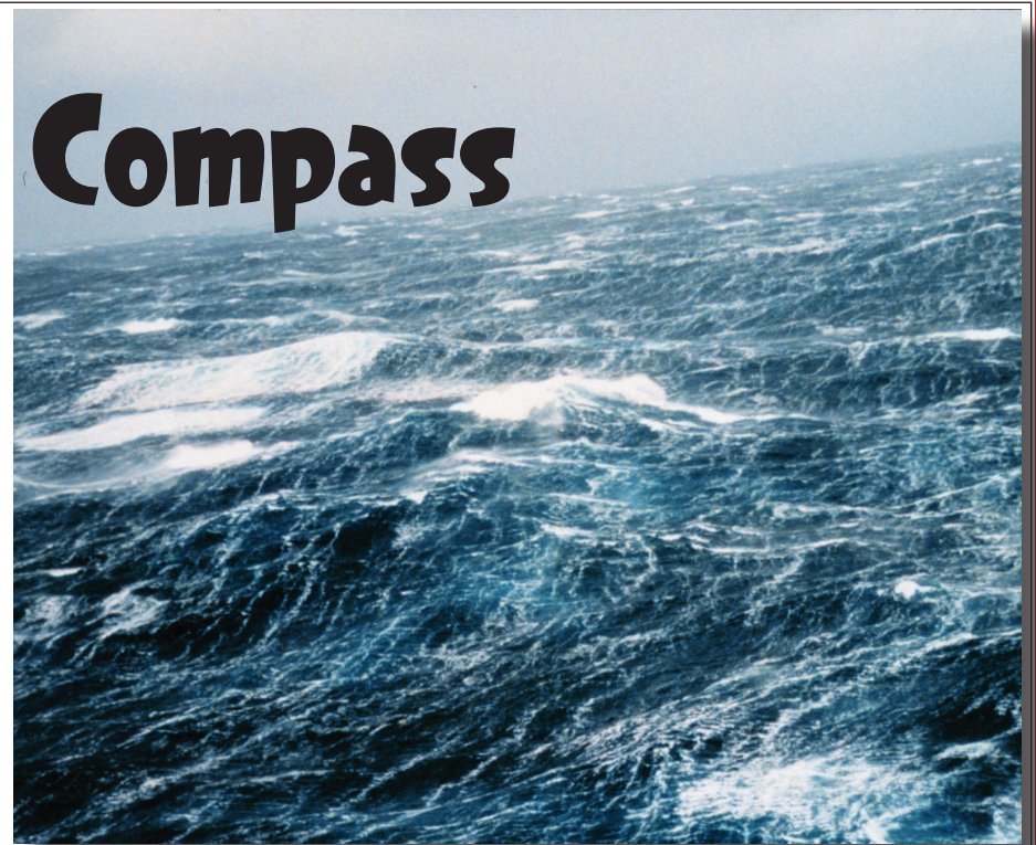
North Pacific storm waves as seen from the M/V NOBLE STAR, Courtesy NOAA

One of the most important improvements to ocean navigation was the invention of the compass. There is some disagreement about who should get credit for this invention. It's pretty clear that the Chinese knew about magnetism as early as 2637 BC, but the first written description of a compass for navigation didn't appear in Europe until 1190. Why did it take so long? After you do this activity, you may have at least one good answer!