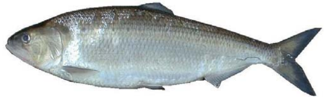
American shad ( Alosa sapidissima )