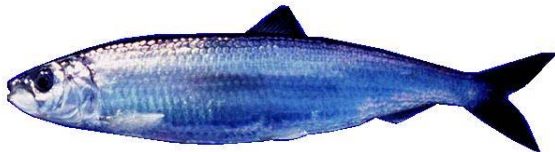
Atlantic herring ( Clupea harengus harengus )