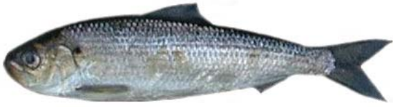
Alewife ( Alosa pseudoharengus )