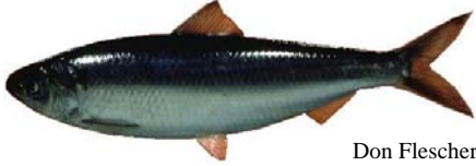
Blueback herring ( Alosa aestivalis )