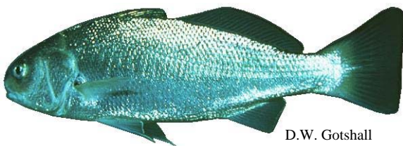
Atlantic tomcod ( Microgadus tomcod )