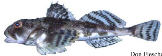
Longhorn sculpin ( Myoxocephalus octodecemspinosus )