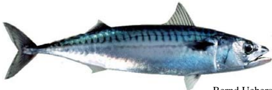
Atlantic mackerel ( Scomber scombrus )