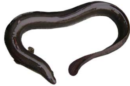
American eel ( Anguilla rostrata )