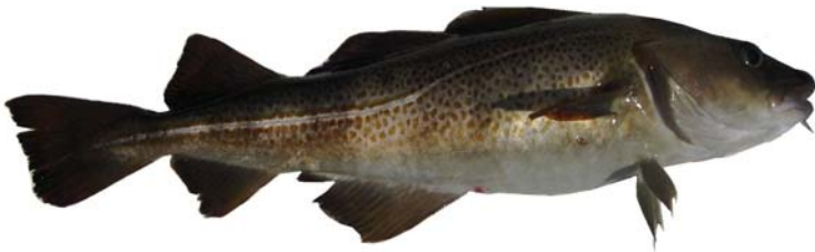
Atlantic cod ( Gadus morhua )