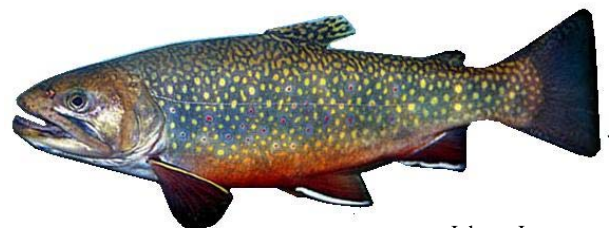
Sea-run brook trout ( Salvelinus fontinalis )