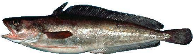
White hake ( Urophycis tenuis )