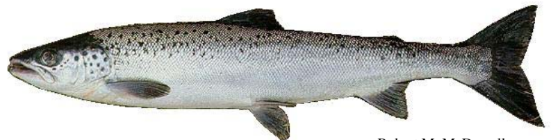
Atlantic salmon ( Salmo salar )