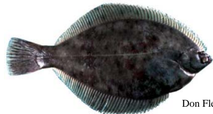
Winter flounder ( Pseudopleuronectes americanus )