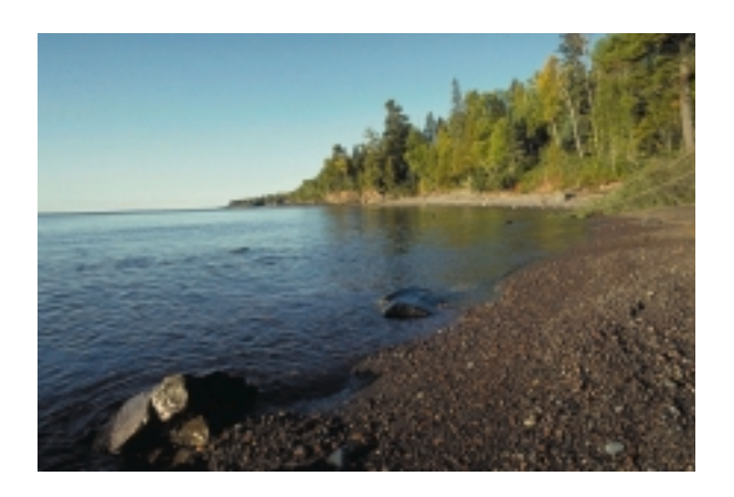
Figure 2: North shore of Lake Superior.