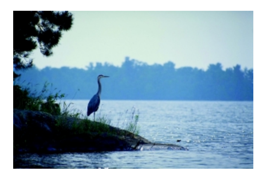
Figure 3: Great Blue Heron.

systems he examined are similar to those of the BWCA.