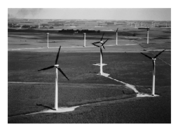
Figure 1: A view of Enron's Minnesota wind farm. Each turbine will generate enough electricity to suply 200-250 homes. They grace the rural landscape along the Buffalo Ridge north of Lake Benton, MN.

Our group has just begun to talk about these ecological issues, in part to communicate with a wider audience like habitat conservation groups and hunting and fishing lobbies. We've jointly sponsored events with senior or religious groups. We're taking our message into the schools.