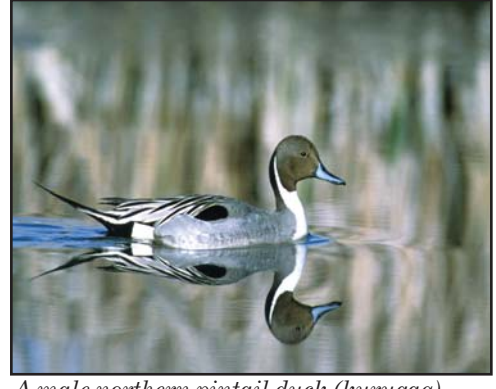
A male northern pintail duck (kurugaq). Pintails were one of the priority birds for bird flu testing because they feed in agricultural areas in winter and some migrate between Alaska and Asia.

We appreciate everyone's effort in keeping informed about the bird flu. Thanks to all of you for being the "eyes and ears" for anything unusual near your villages!