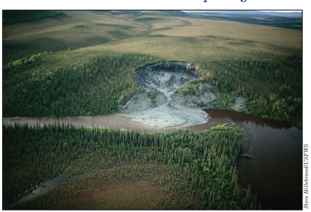
Aerial view of the landslide in the Selawik River headwaters, August 2006.

The 2.1-million-acre Selawik National Wildlife Refuge in the Selawik River valley and Kobuk River delta was established in 1980 to conserve caribou, birds, salmon, and sheefish, to provide for continued subsistence uses, and to ensure necessary water quantity and quality.