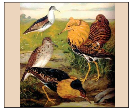
Ruffs in breeding season.

For instance, last summer Selawik residents spotted a never-before-seen bird in their village. Clyde Ramoth snapped its photo and biologists identified it as a ruff, a type