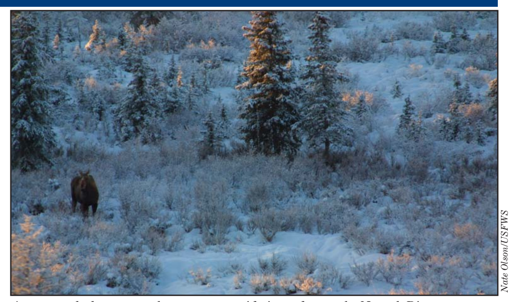
A moose calmly surveys the scene on a midwinter day on the Noatak River.