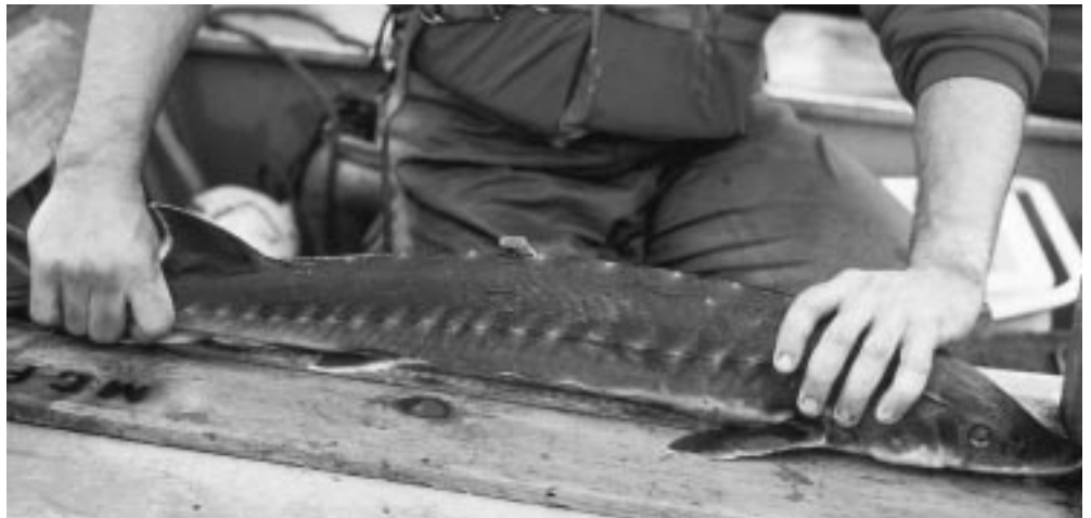
Catch and release. Service biologist work to measure and tag this wild Atlantic sturgeon.

Editor’s note: To read more about the Zuni Pueblo eagle aviary, see the May/June 2000 issue of Fish & Wildlife News.