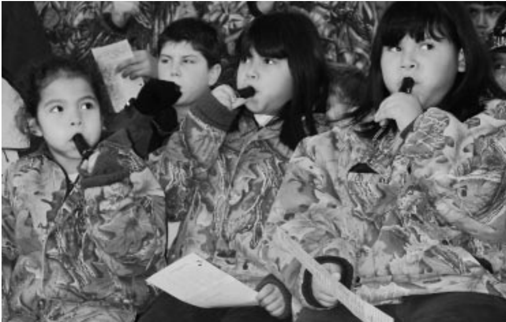
Calling all ducks. These schoolchildren practice their goose calls at Anahuac NWR at the Youth Waterfowl Expo 2000.