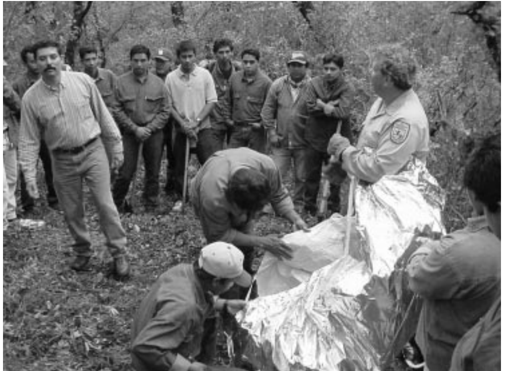
Cross-border. Mexican crews learn to help fight fires south of the Rio Grande.

The group spent several hours in the field with hands-on training, using hand tools, practicing line construction and making fire shelters. The Mexican fire crew will now be able to support fires on both sides of the Rio Grande.