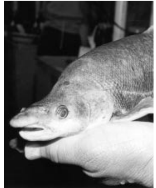
The shape of things. Bonytail chub are built for life in turbulent water.

Toward that end, Keeler-Foster has employed leading-edge technology to manage the bonytail chub stock on the genetic level. The center’s laboratory was recently equipped with a DNA sequencer, an apparatus that allows Keeler-Foster to identify individual fish by their genes.