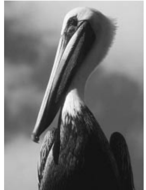
Inhabitant of the first national wildlife refuge.

In April 1901, William Dutcher, chairman of the Audubon Bird Protection Committee, asked Palmer to go to Tallahassee to meet with the Florida legislature about passing the "Audubon Ornithologist's model law" to protect non-game birds. Prior to 1901 only five states had satisfactory laws for non-game birds. The committee, essentially