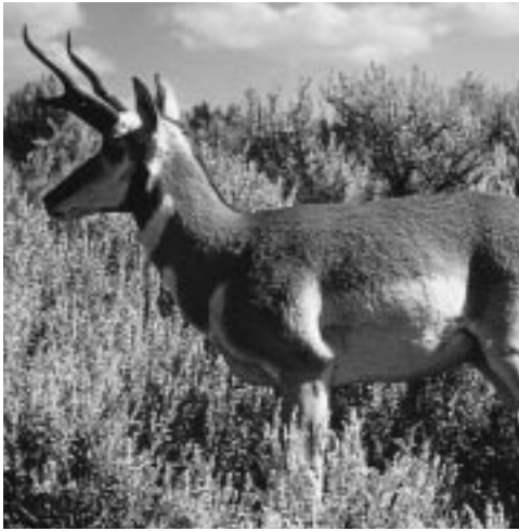
Sonoran pronghorn.

To boost pronghorn survival, Hervert has begun to trudge water into the refuge on an experimental basis. He takes midnight hikes through the desert to fill tub-like containers with five gallon jugs.