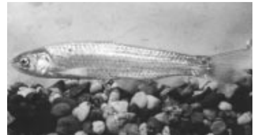
Clinging to survival. Rio Grande silvery minnow.

Only in the last half century has the minnow's floating egg become its Achilles' heel. Though the species was listed as endangered in 1994, its steady decline coincided with flood-control and river channelization projects that began in the 1940s and eventually converted the Rio Grande from a wide, shallow, meandering river to a much narrower and deeper one. The minnow's range likely ebbed as insulated oxbows and shallow pools disappeared on the banks or dissolved into the newly controlled current.