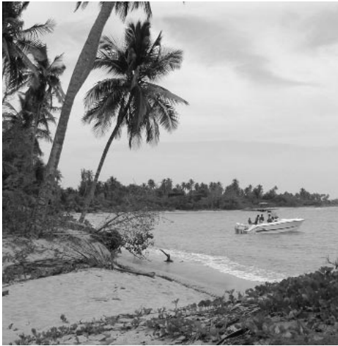
New tropical island paradise. Prime turtle nesting beaches at Vieques NWR.