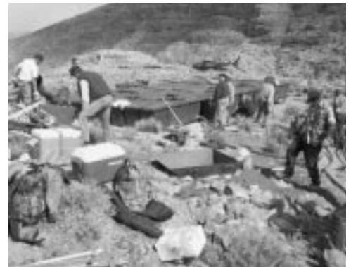
Rain catcher. A 45-foot by 70-foot steel apron feeds infrequent rains to these four 1,800-gallon tanks. Rock will be cemented around the water trough (center) to bring it up to ground level.

In less than six hours the volunteers assembled more than six tons of sheet metal, plastic pipe, concrete and steel—a complete structure that will capture the infrequent but intense rainfall and keep the precious liquid available for the sheep and other creatures that travel this starkly beautiful landscape. Bringing in the material was only part of the job. Generators, welders, cement, 55-gallon drums of water, even a cement mixer, were flown in and out that day.