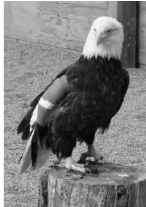
Rescued. This bald eagle, which was struck by a car and had a wing amputated, lives at the Zuni Aviary.

The law did, however, provide for Native American religious use of eagle feathers, and the Service established the National Eagle Repository near Denver to store eagle carcasses specifically for the purpose of