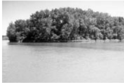
New temperate muddy island paradise. Michigan's Mud Island.