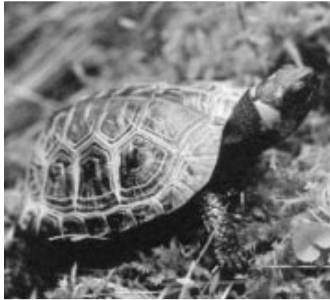
Really moving. The bog turtle is listed as threatened for a number of reasons: habitat degradation, loss of habitat and illegal collection.