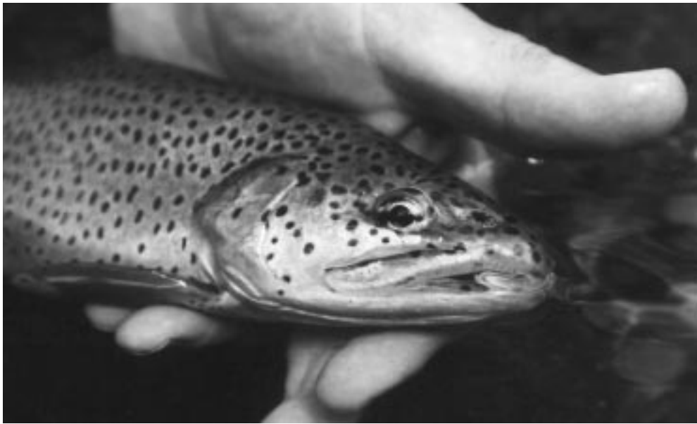
In good hands. Apache trout may soon be the first fish fully recovered.

You can catch rainbow trout in virtually every state, but there's only one place you can fish for the rare Apache trout—the high country streams of eastern Arizona. The tall peaks of the White Mountains capture winter storms that in summer feed the fine coldwater streams that rim the mountain range. Mere hours from Phoenix, Albuquerque and El Paso, the White Mountains offer visitors the opportunity to wade a stream or paddle a lake and fish for this rare golden native trout.