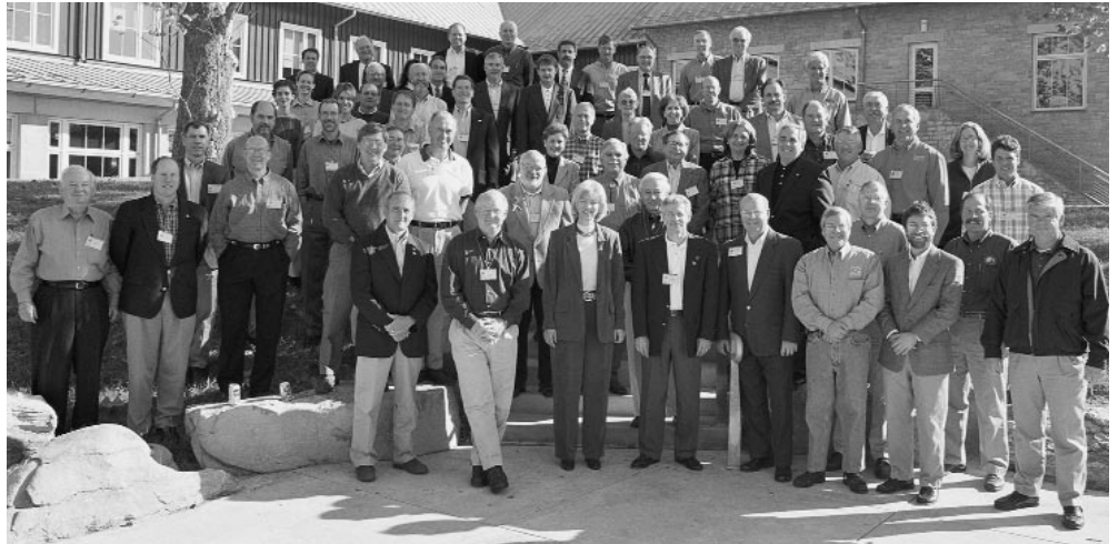
NCTC hosts stately crowd. Secretary Gale Norton poses with chief executive officers of state Department of National Resources.

Wow! Children look at a black bear skin at the Choctaw Family Celebration. The Jackson, Mississippi, Ecological Services Field Office shared a booth at the April event with the Choctaw Tribe Environmental Resources organization, bringing animal skins and mounts, and Service information, to the more than 4,500 students and 2,000 adults who attended the event. Educational items earning the most attention and appreciation at the Service booth were the black bear skin rug, an alligator skull, a wild boar skull and a young corn snake. The snake, “Mr. Maze,” is used for educational purposes to help teach people facts about snakes, dispel myths, and give people an opportunity to touch a live snake.