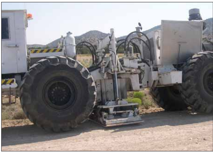
Above is a vibroseis truck, which is used as the source of seismic waves to image underground structure. The truck was provided to this year's SAGE program by Input/Output Inc.

For more information about SAGE, go to the program's Web site at <a href="http://www.sage.lanl.gov">http://www.sage.lanl.gov</a> online.