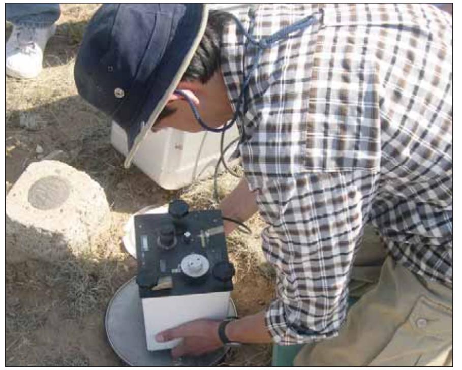
A student in the Laboratory's Summer of Applied Geophysical Experience (SAGE) program measures Earth's gravity field using a gravity meter.

Student participated in a variety of surveys as part of the field work. They collected seismic data, using both a hammer and a Vibroseis truck as sources for the vibrations for surveys of two different scales. They measured Earth's natural electrical currents as well as inducing currents in the ground, as part of an effort to determine the depth to and quality of ground water. Students also measured minute deviations of Earth's gravity field to determine the locations and shapes of underground rock layers and faults. After all of the