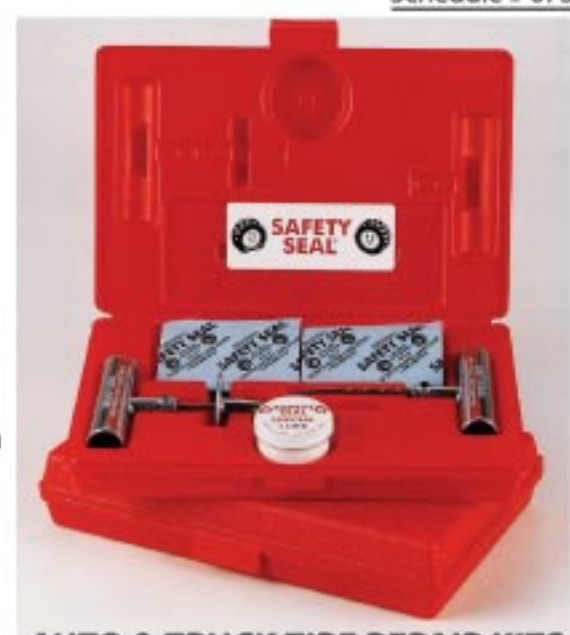
AUTO & TRUCK TIRE REPAIR KITS

6274-B New Copeland Rd. Tyler, TX 75703-6316 1-903-534-9995 EMAIL jjrich@cox-internet.com WEB www.safetyseal.com