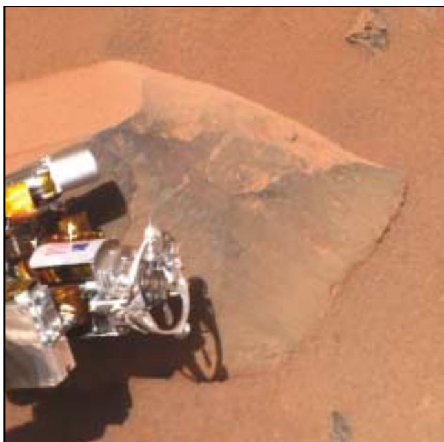
This image shows the Mars Exploration Rover Spirit's "hand," or the tip of the instrument deployment device, poised in front of the rock nicknamed Adirondack. In preparation for grinding into Adirondack, Spirit cleaned off a portion of the rock's surface with a stainless steel brush located on its rock abrasion tool. The image was taken by the rover's panoramic camera.

Together, the 384-pound rovers make up an $820 million mission to seek out geologic evidence that Mars was a wetter world possibly capable of sustaining life. NASA launched Spirit on June 10 and Opportunity on July 7.