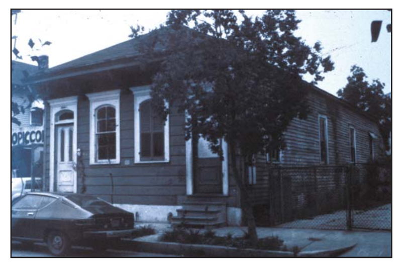
Circa 1890 shotgun cottage prior to rehabilitation.

Application 2 ( Incompatible treatment ): In the second example, radical changes made during the rehabilitation obliterated the characteristic shotgun plan. The wall between Room #1 and Room #2 in both units was removed to create one large room in each unit. Almost the entire rear half of the unit on the right side was incorporated into Unit A on the left side. This effectively destroyed most of the wall separating the two units that defined the shotgun plan. In addition, greatly truncating the length of Unit B further impacted the plan by eliminating the progression of rooms so typical of shotgun interiors. To make up for the space lost from Unit B on the right side a staircase was added to access two bedrooms that were created in the attic. Converting Unit B from a one-story unit into a two-story unit further altered the historic character of the house. The units no longer convey a sense of the original shotgun plan as a result of these changes. Accordingly, the project fails to meet the Standards for Rehabilitation.