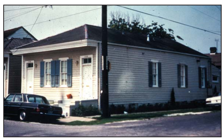
Circa 1900 double shotgun cottage prior to rehabilitation.

Application I (Compatible treatment): In the first example, the shotgun plan was generally retained in the rehabilitation with some modifications. Kitchens were inserted into the second room of each half of the duplex; a bathroom and laundry were inserted into the third room. The fourth room on each side of the building was enlarged by moving the partition forward a few feet. Despite these alterations, the historic division of the cottage into two equal units was respected in the rehabilitation. The linear arrangement of small rooms, one behind the other, was also maintained on each side. Thus, on both the exterior and interior, the building has the same appearance as it did historically, as a modest double shotgun cottage. This plan, which largely determines its historic character, remains following the rehabilitation. The project meets the Standards for Rehabilitation.