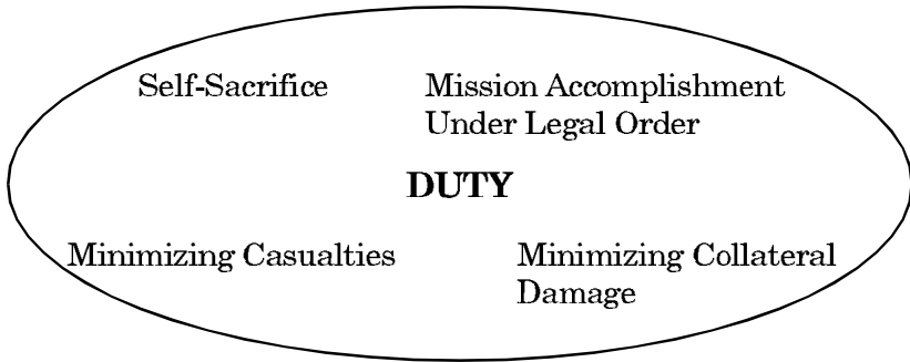
Figure 5. A Coherent View of the Officer's Duty.

defending society would be undermined. And, as indicated earlier, that is not morally permissible. But, that there can be such claims must be understood before we have a complete conception of sacrifice for the military professional. The Just War Tradition (JWT), upon which the Laws of Land Warfare are founded, embody one such set of obligations. JWT recognizes that everyone has the right to life and liberty, regardless of the nation to which they belong. This right can be mitigated, even negated, but only under a certain set of conditions.