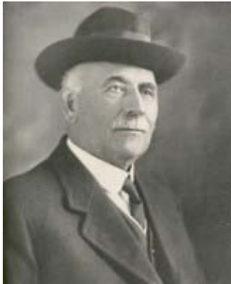
Congressman Dorsey W. Shackleford

began at 8 pm with Representative Dorsey W. Shackleford, the acting chairman, and Representatives Martin B. Madden and Richard W. Austin in attendance.