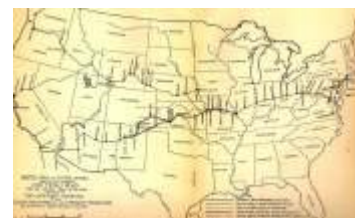
US map showing proposed location of National Old Trails Road

The convention adopted a route along the Cumberland Road, the Cross-State Highway through Missouri, the "Old Santa Fe Trail" to Santa Fe and "from Santa Fe west on the most historic and scenic route to the Pacific Coast." Possibly, debate within the Committee on Constitution and By-laws, not reported in the proceedings, blocked adoption of the Ocean-to-Ocean Highway's route through New Mexico, Arizona, and California during the first