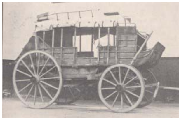
Stagecoach donated to Old Trails Road Committee of the D.A.R. by Buffalo Bill Cody