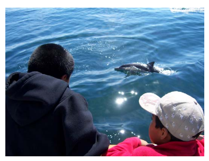
Emily Ritchen Elementary 6th graders observe a common dolphin during their culminating MERITO Academy trip to Anacapa Island.

On May 27, 27 primarily Hispanic MERITO Academy seventh graders from a low-income middle school in Oxnard embarked on the R/V Shearwater towards Anacapa Island. Rocio Lozano-Knowlton and Shauna Bingham led the educational expedition. The students collected and identified plankton species. Upon their arrival, the students participated in hands-on educational activities, an interpretative hike, and the Channel Islands Live! dive program.