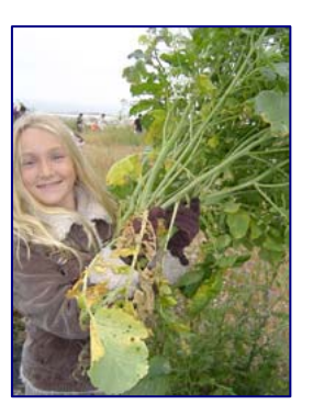
A 5th grader from Canalino Elementary proudly removes an invasive plant at Coal Oil Point Reserve.

meaningful field experiences. The students conducted sandy beach monitoring using LiMPETS protocols, explored the magnificent COPR tide pools, and assisted graduate students from the UCSB Donald Bren School of Environmental Science and Restoration in removing approximately 800 pounds of invasive plants by the slough. The students also observed endangered Snowy Plover and received a briefing about their natural history from researcher Jennifer Stroh.