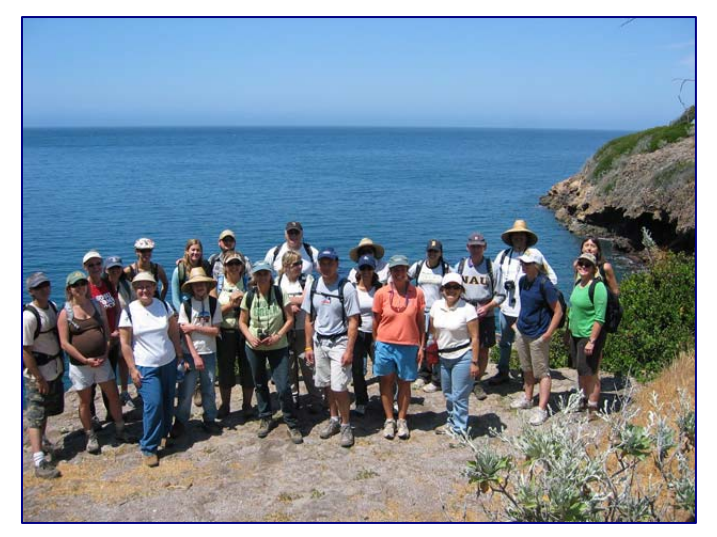
TEAWET teachers enjoy Pelican Bay after a hike from Prisoners Harbor, Santa Cruz Island.

Teacher Enrichment Adventure in Watershed Education and Training (TEAWET) Program Visits Sanctuary On June 16, twenty TEAWET teachers participated in an educational trip to the sanctuary and Santa Cruz Island. The teachers learned about the research capabilities of the R/V Shearwater and collected plankton in the Santa Barbara Channel on their way to the Island. While on the Island, the teachers met with members of the Wildlife Conservation Board and the Nature Conservancy to discuss their work on watershed issues. They also participated in a hike from Prisoner's Harbor to Pelican Bay led by a CINC Volunteer, and learned about native and endemic species living on the Island. The TEAWET program is a B-WET funded teacher professional development project of the UCSB Gevirtz Graduate School of Education. TEAWET focuses on watershed issues in Santa Barbara and Ventura counties. Participating teachers discover new ways to use inquiry and the local environment to teach science and how to use the watershed, from mountaintops, to creeks, to beaches, as a context for teaching social studies, art, language skills, math, and other disciplines.