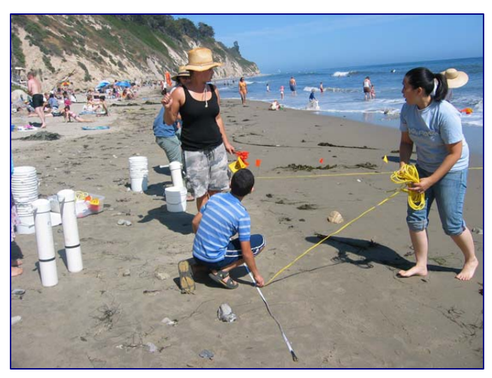
The LiMPETS sandy beach monitoring program in action at Arroyo Burro Beach in Santa Barbara.

LiMPETS is an environmental monitoring and education program for students, educators, and volunteers groups throughout California. Approximately 3,500 teachers and students along the coast of California are collecting rocky intertidal and sandy beach data as part of the LiMPETS network. Learn more about LiMPETS online at http://limpetsmonitoring.org/.