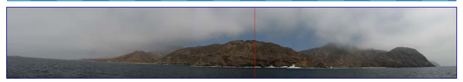
Photo mosaic of southwestern Santa Cruz Island, overlaid with the eastern Gull Island marine reserve boundary (shown here as a red line). This image was taken approximately 450 m from shore.