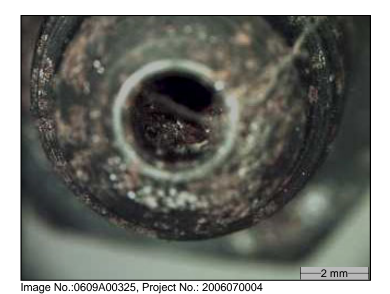
Figure 4. Close up of disconnected fuel line connector nipple showing the interior debris.