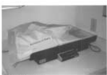
Scale to weigh hobics.