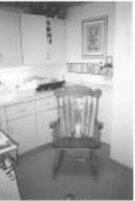
... To rock live aborted habies until they pass away.