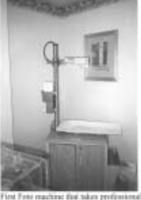
First Finis machine flui takes professional pictures of aborted bubbs if purents wans this keepsake.