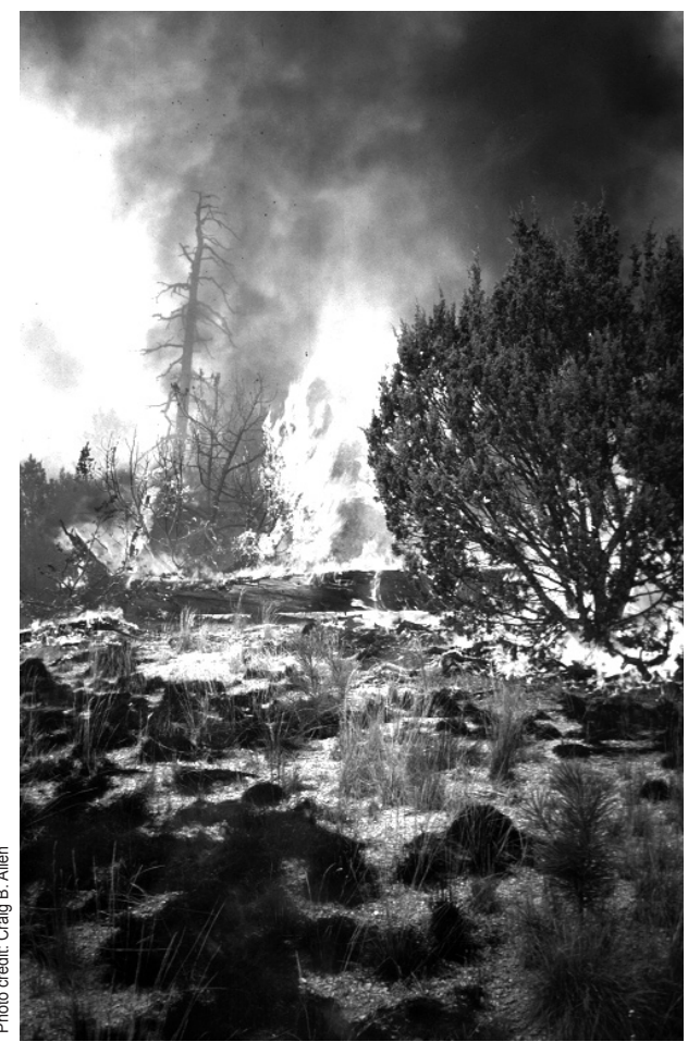
Prescribed fire in the Bandelier Wilderness, New Mexico.

This fiscal year, the development team will complete the application by identifying and providing additional data sources and hosting