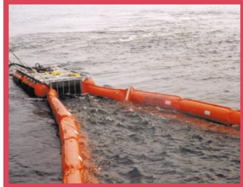
"Slickbar Dip 600 Oil Recovery System currently used by the U.S. Coast Guard."

Orders can be placed through GSA Advantage! at http://www.fss.gsa.gov or orders may be placed directly to: