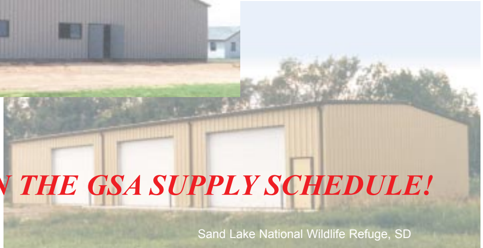
Sand Lake National Wildlife Refuge, SD