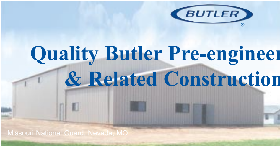
Missouri National Guard, Nevada, MO