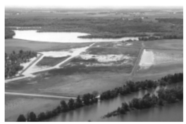
Port Louisa NWRP

Mark Twain Refuge, and consequently the individual refuges within it as a Complex, shares much of its history with the Upper Mississippi River National Wildlife and Fish Refuge, the U.S. Army Corps of Engineers, and the five states of the UMRS. The Refuge was officially established in