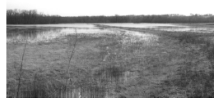
Moist-soil unit, Mark Twain NWR Complex

Both the Bureau of Biological Survey (BBS), which later became the FWS, and the COE recognized the damage to wildlife that was resulting from the first locks and dams installed at Hastings, Minnesota, and Keokuk, Iowa. The pools that formed behind the dams slowed flowage and decreased the oxygen level in the water. Silt on the riverbed killed some aquatic animals,