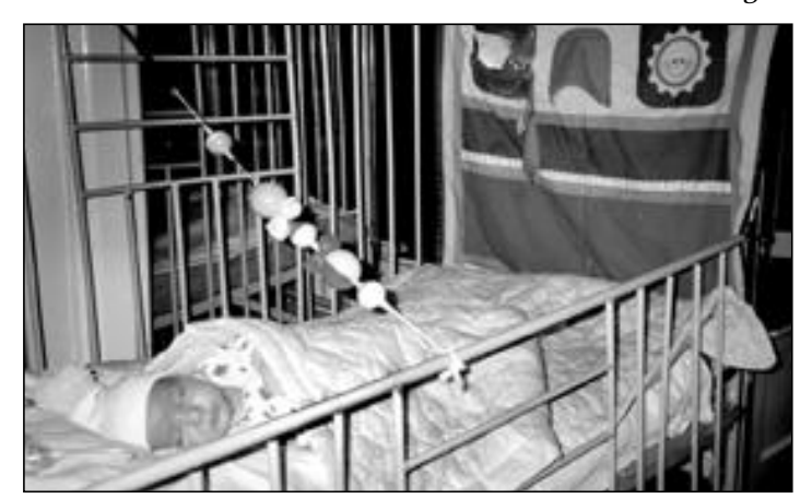
A baby sleeping soundly in a hospital in Sarov is covered by a quilt made by several Los Alamos women. Another Los Alamos-made quilt hangs near the foot of the crib. Lab scientists delivered the quilts to Russia during a recent trip.